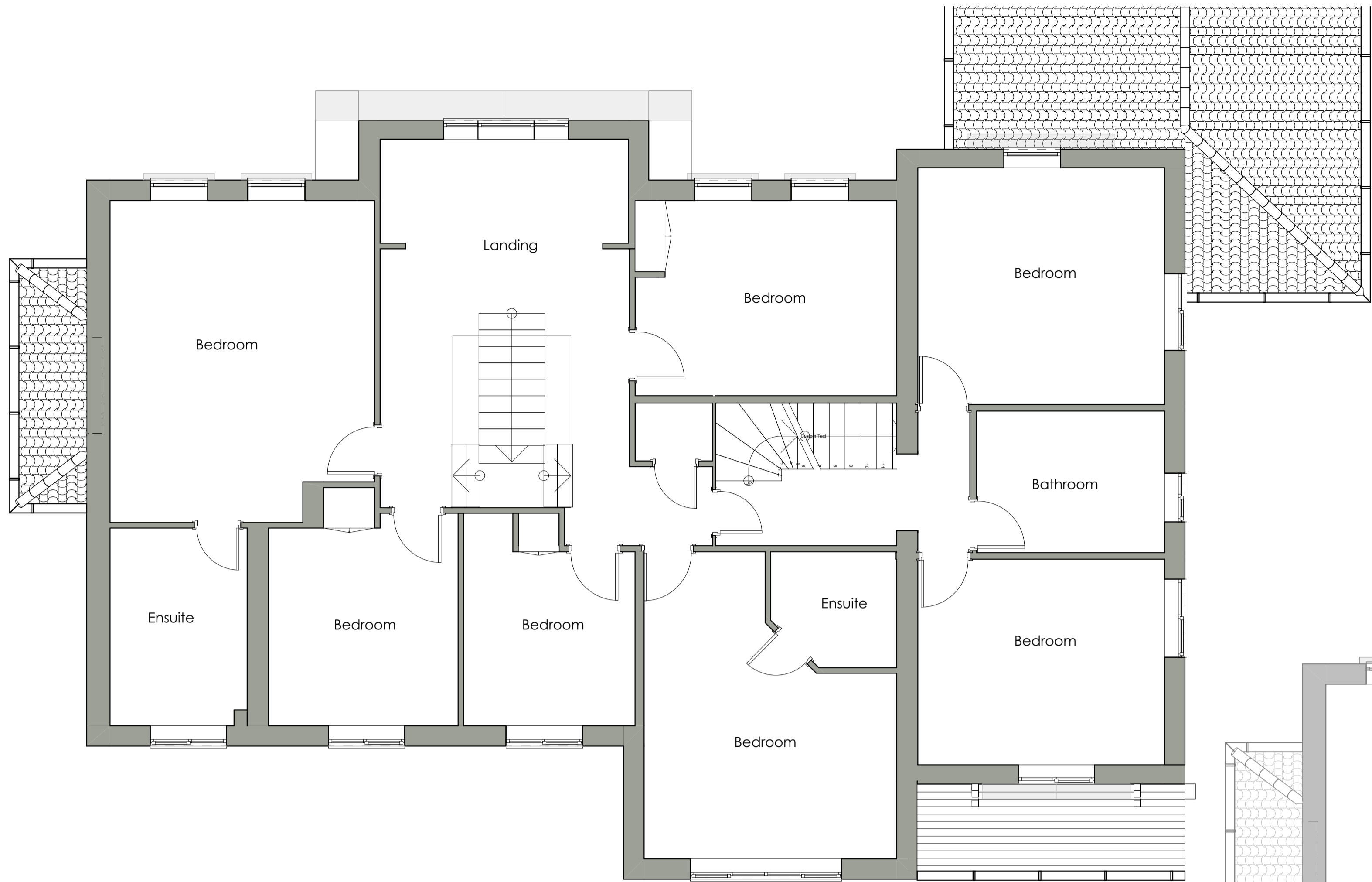
First Floor as existing 1:50