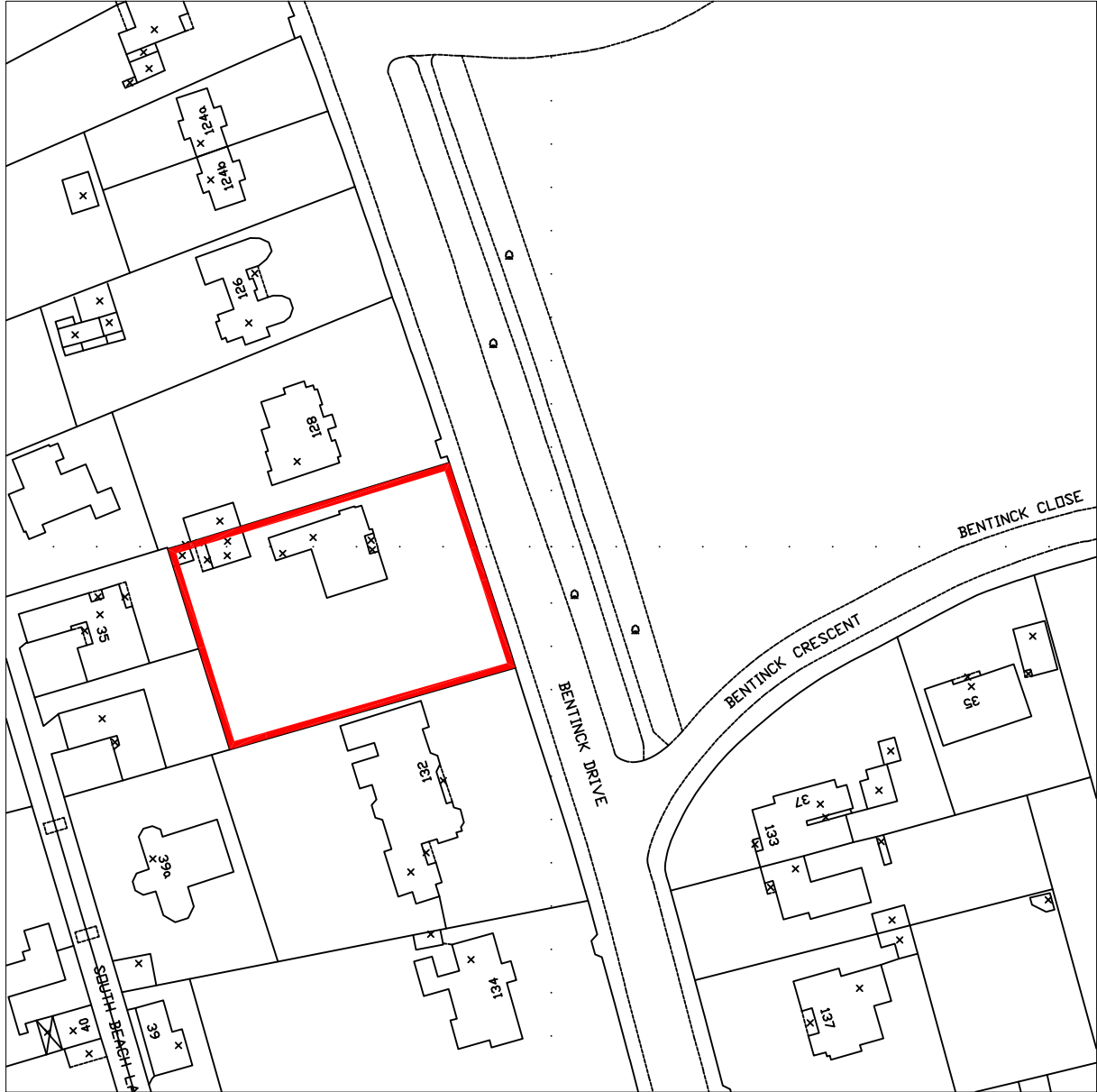
LOCATION PLAN SCALE 1/1250