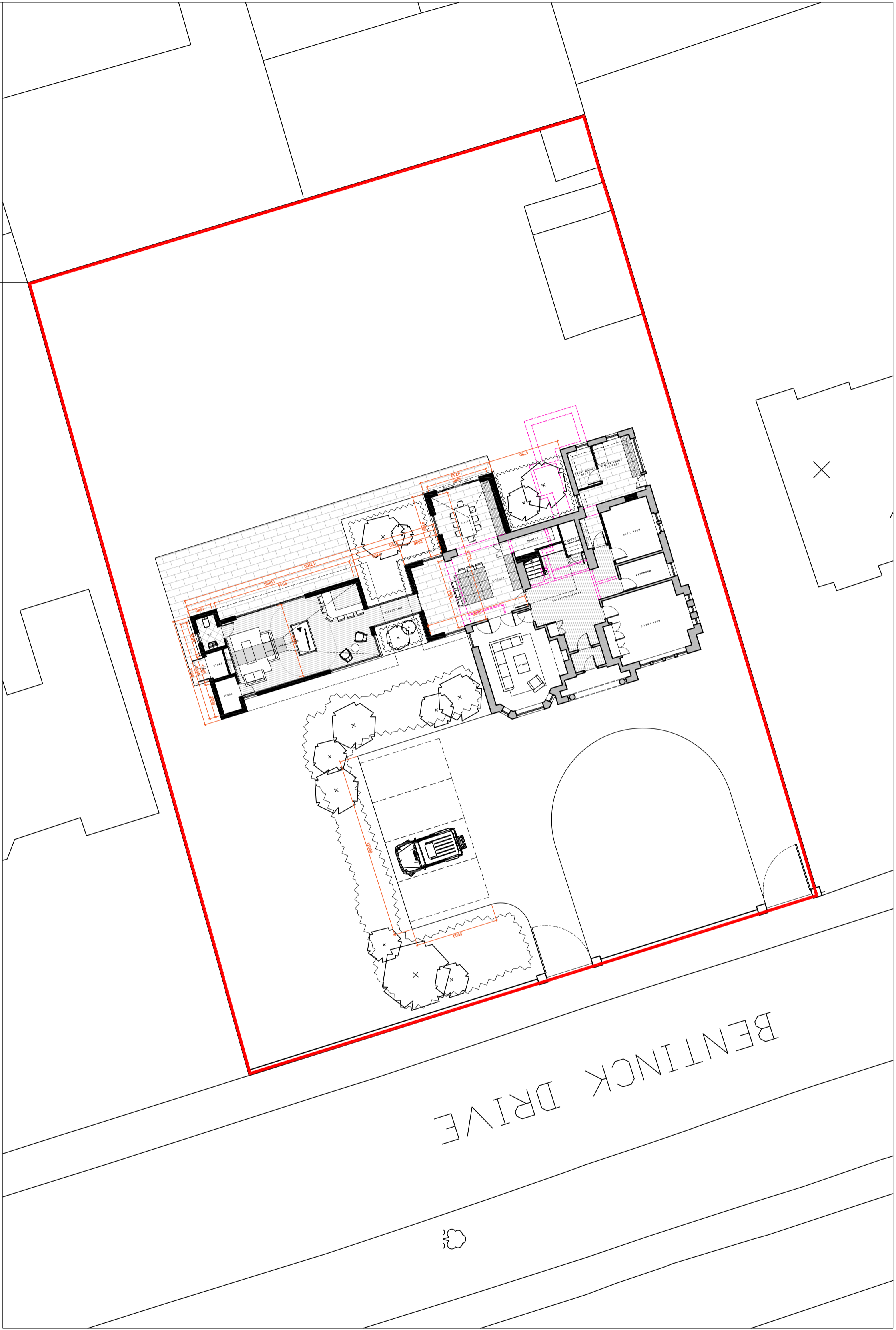
SITE PLAN AS PROPOSED SCALE 1/200

This drawing, its contents and all information contained therein is provided by the architect/drafter for preliminary or planning purposes only unless specifically noted otherwise below, and does not constitute a construction issue drawing.