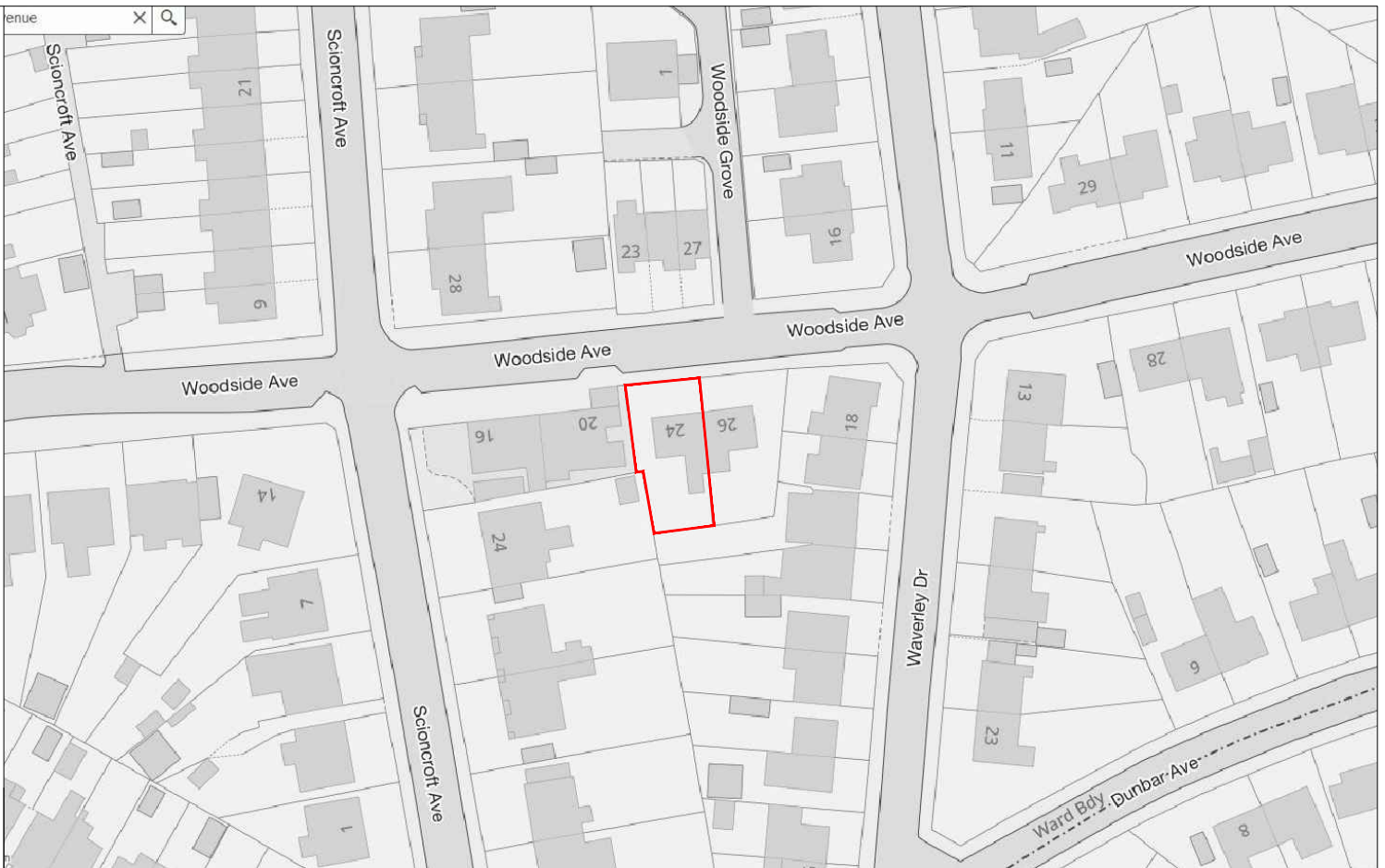
location Plan 1:1250