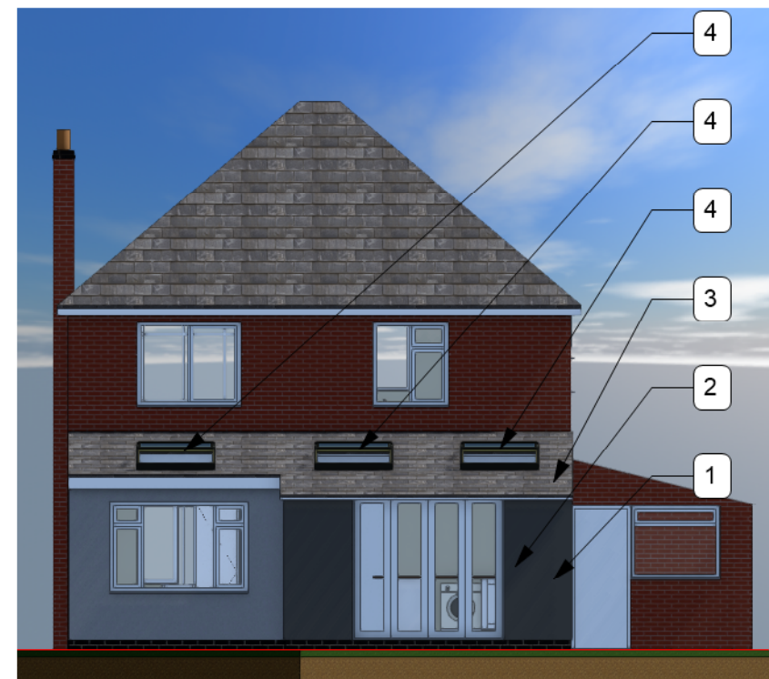
2 West Elevation - Proposed Scale: 1:100