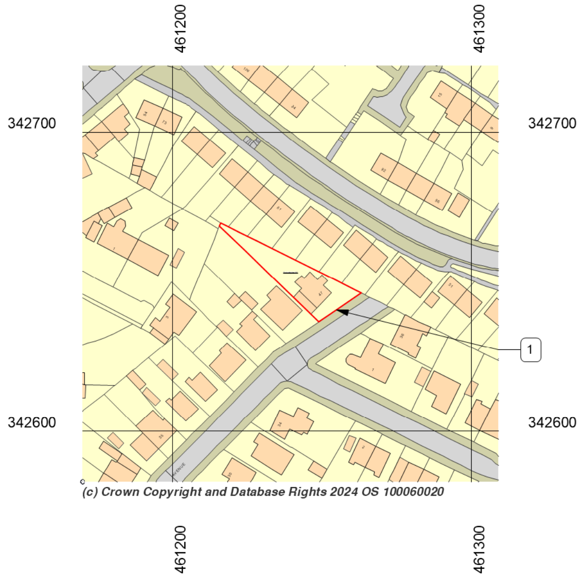
1 Location Plan Scale: 1:1250