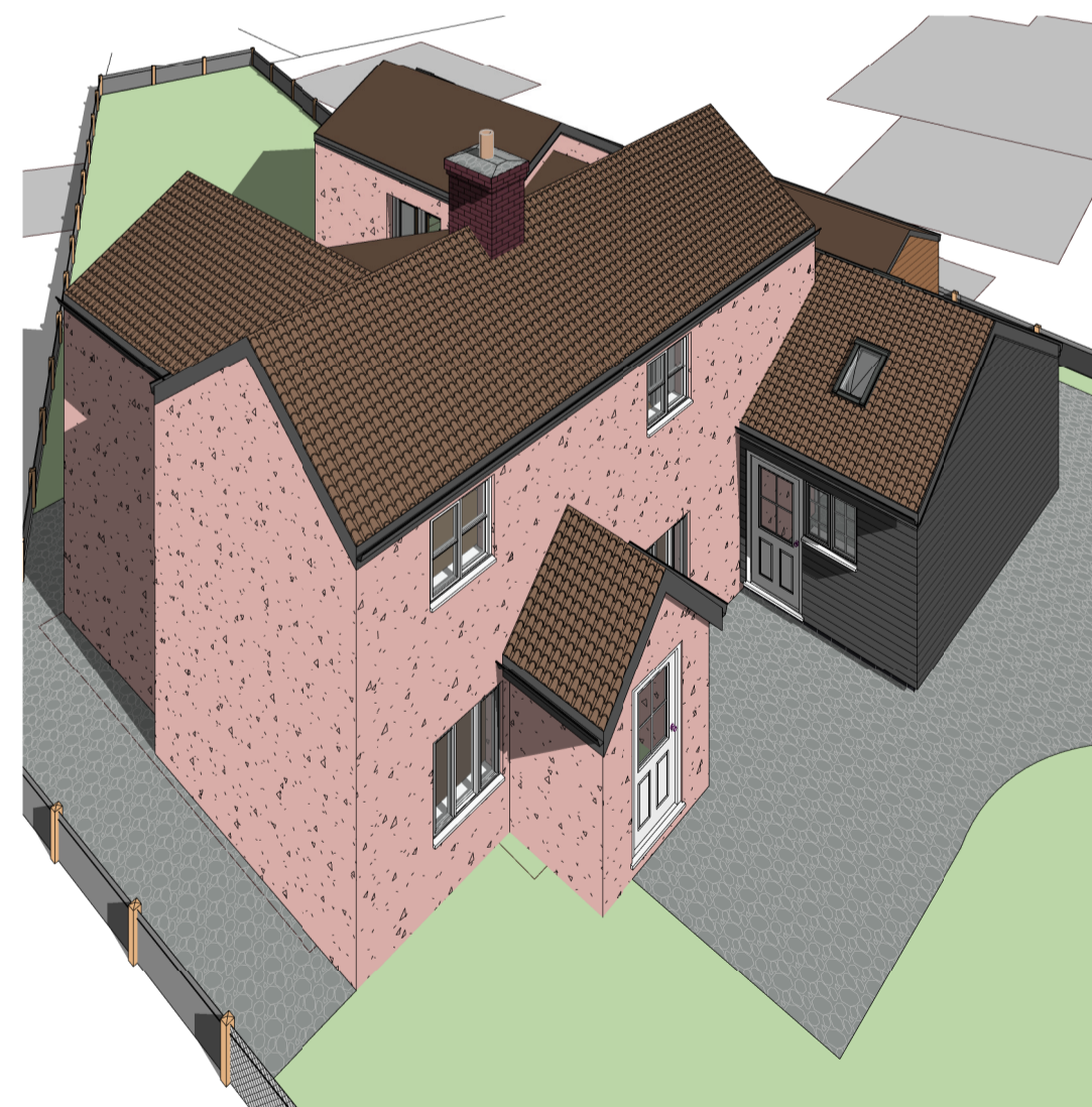
3D View 5