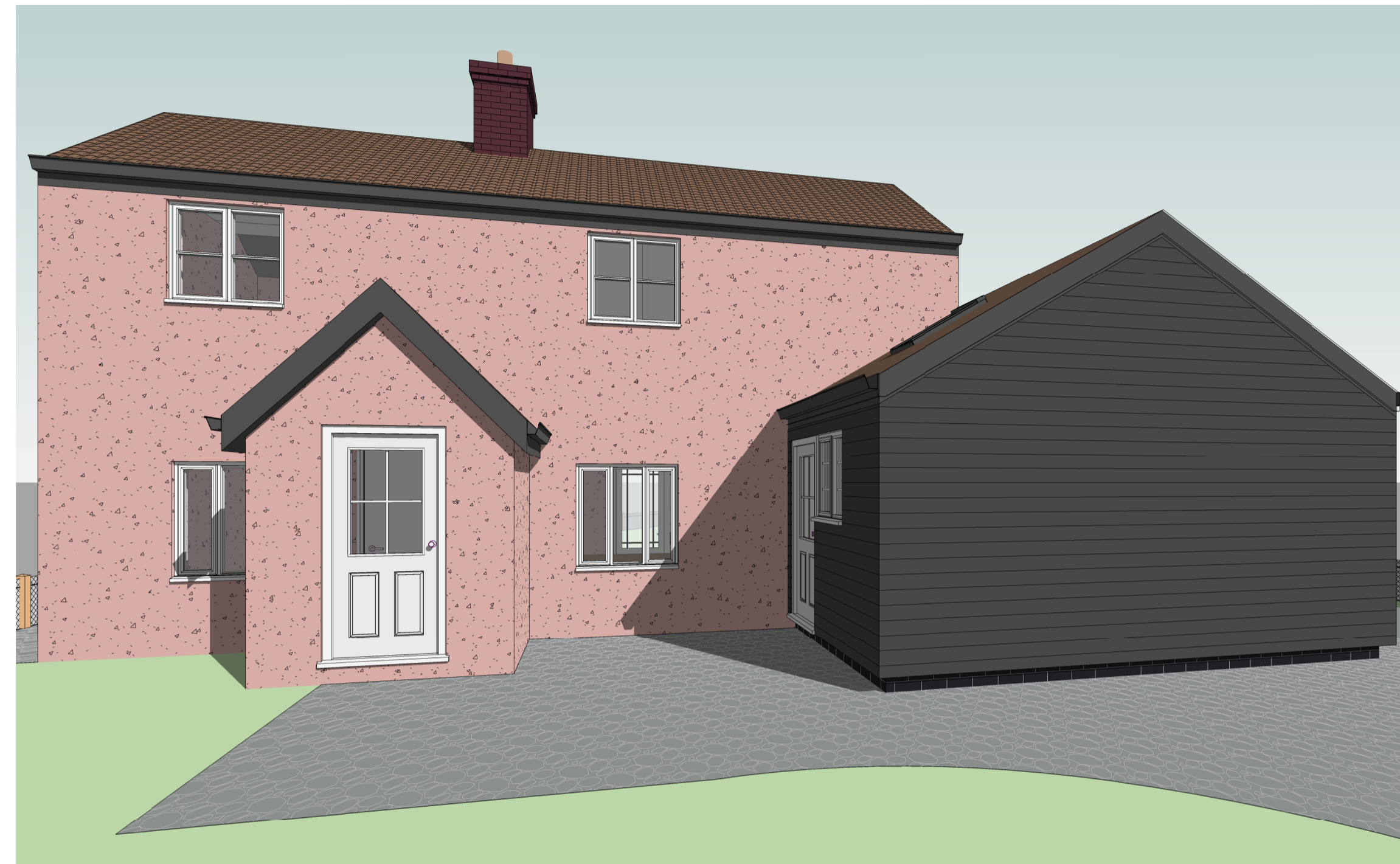
3D View 1