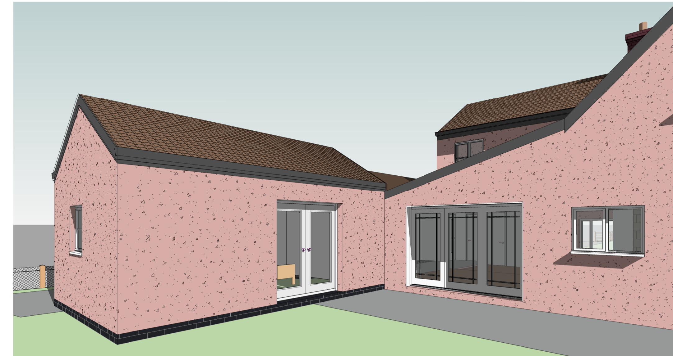
3D View 2