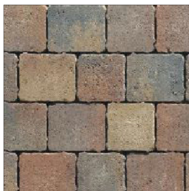
Tobermore: Hydropave permeable paving; 'Heather'