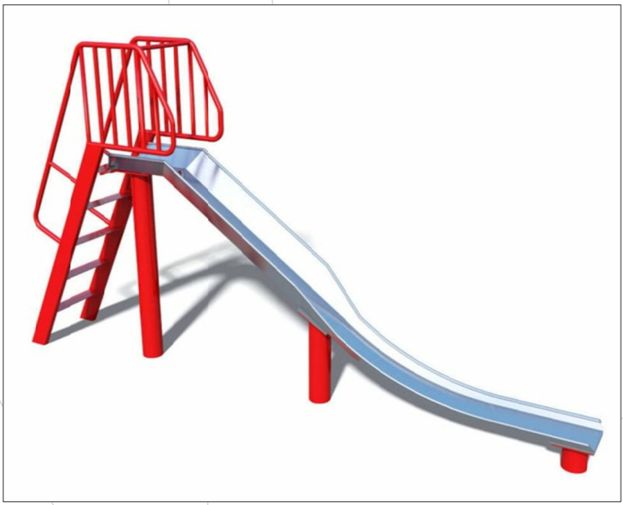
Slide for older children

Notes Plan to be read in conjunction with the engineer and landscape drawings. No measurements to be scaled off drawing. Worked from figured dimensions only. All dimensions shown on drawing are shown in millimetres unless otherwise stated. All dimensions and levels to be checked on site. Landscape Architect to be notified immediately of any discrepancies prior to the commencement of works.