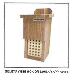
SOLITARY BEE BOX OR SIMILAR APPROVED