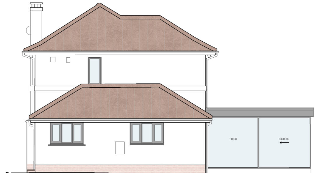
Side Elevation (North)