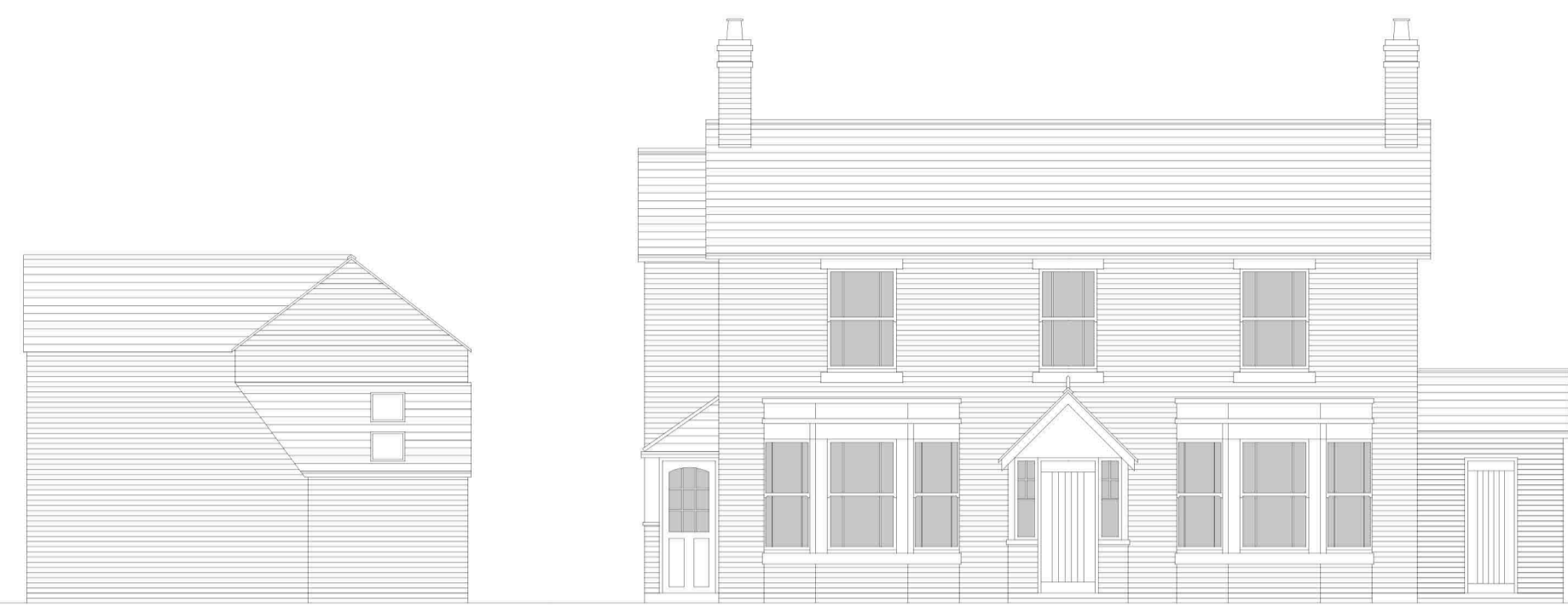
Existing Front Elevation 1:100