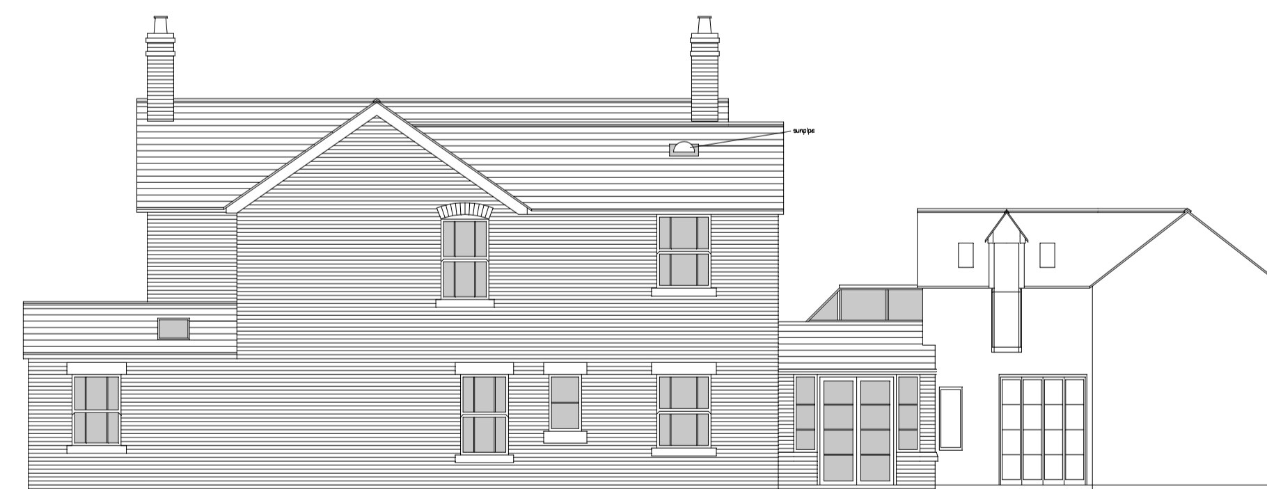
Proposed Rear Elevation 2978