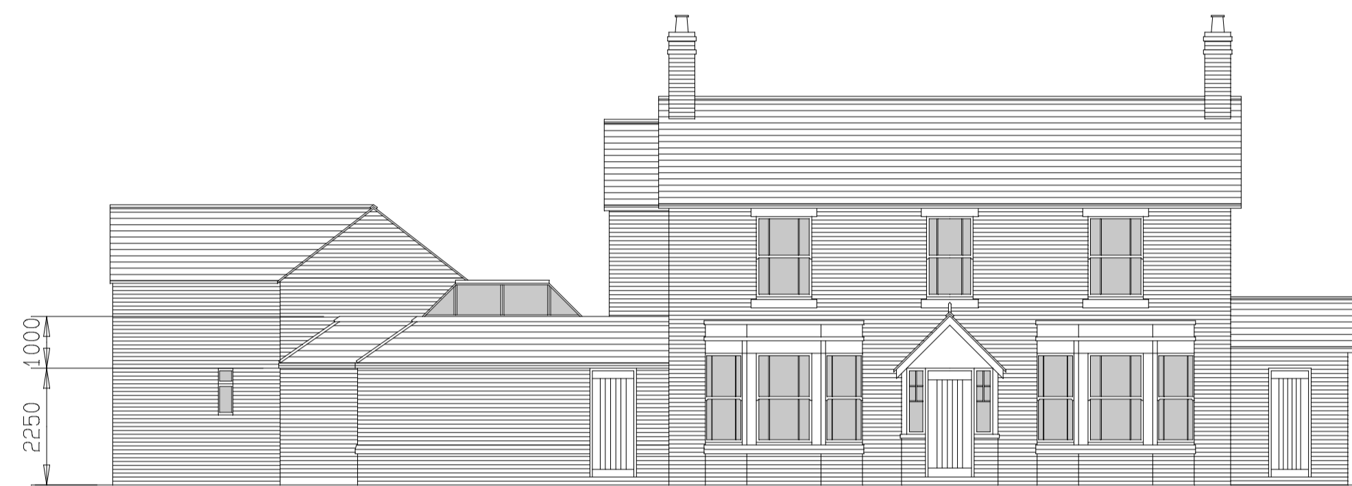
Proposed Front Elevation 1:100 6004