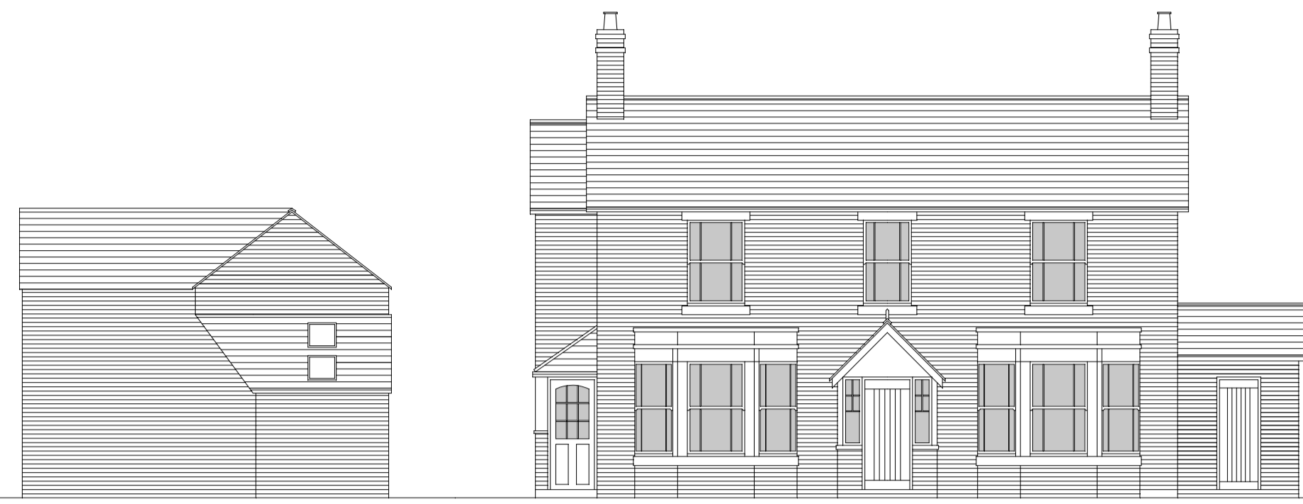
Existing Front Elevation 1:100