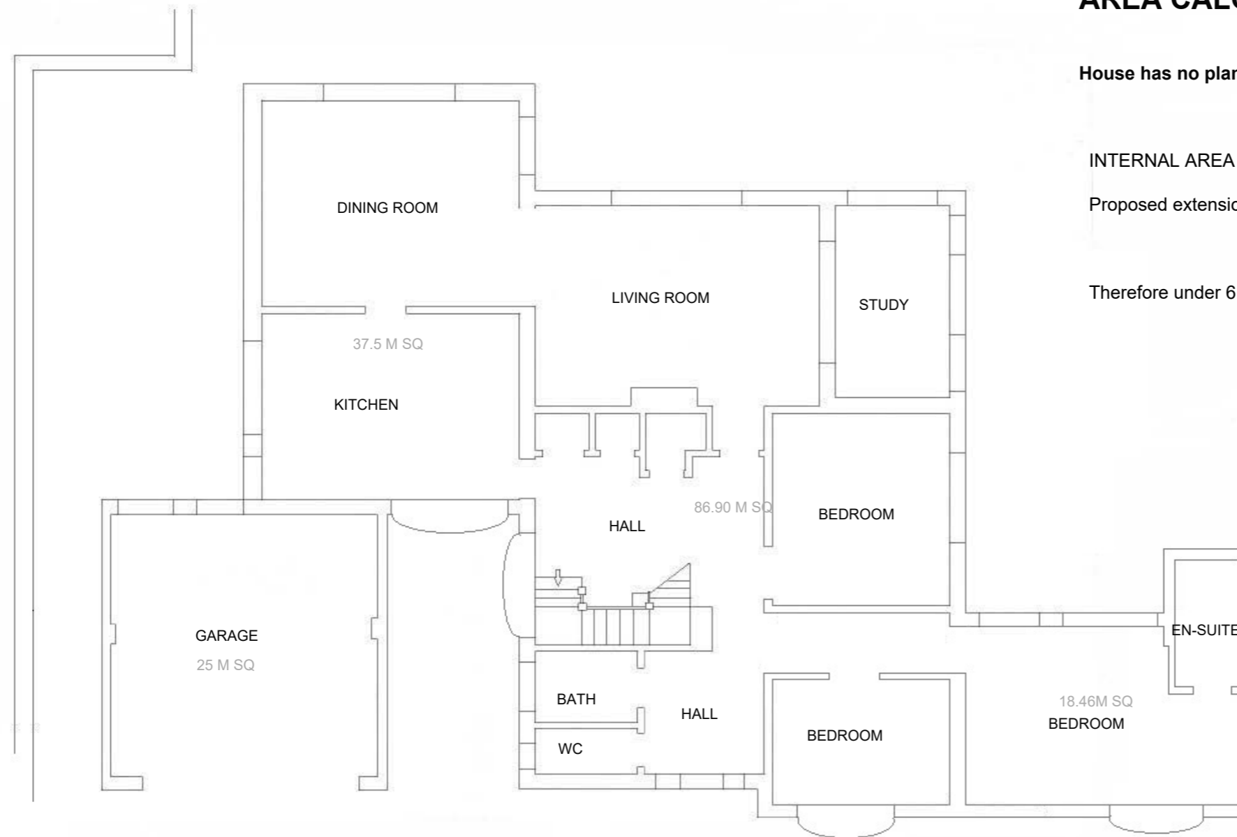
Existing Ground Floor Plan 1 ; 50

Therefore under 6 % uplift so acceptable.