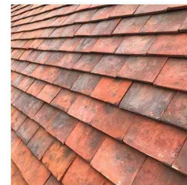
Above. Roof tiles: Heritage Conservation Weathered handmade clay.