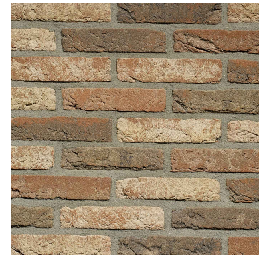
Above. Facing brick: Wienerberger Mozart Blend 50mm.