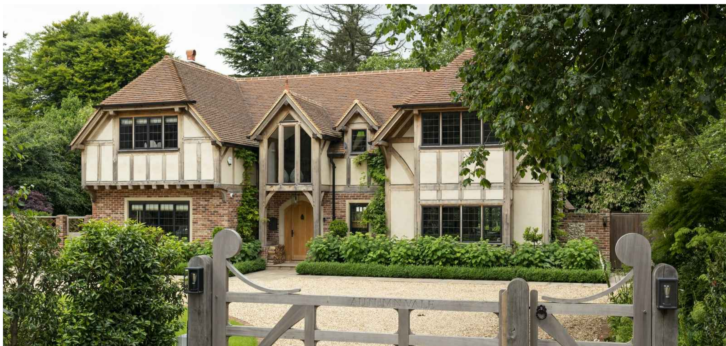
Example of proposed exterior materials palette.