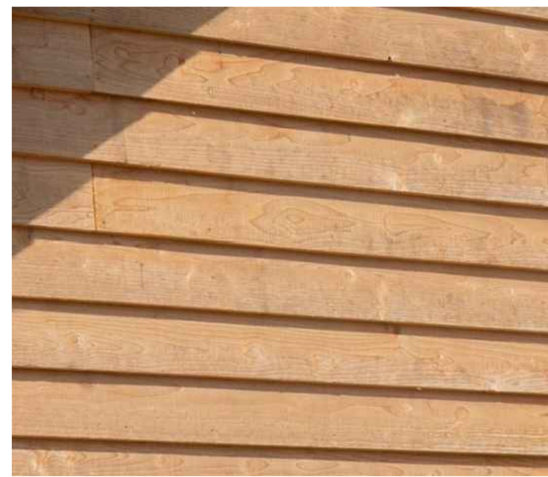
Above. Natural Douglas fir cladding to carport.