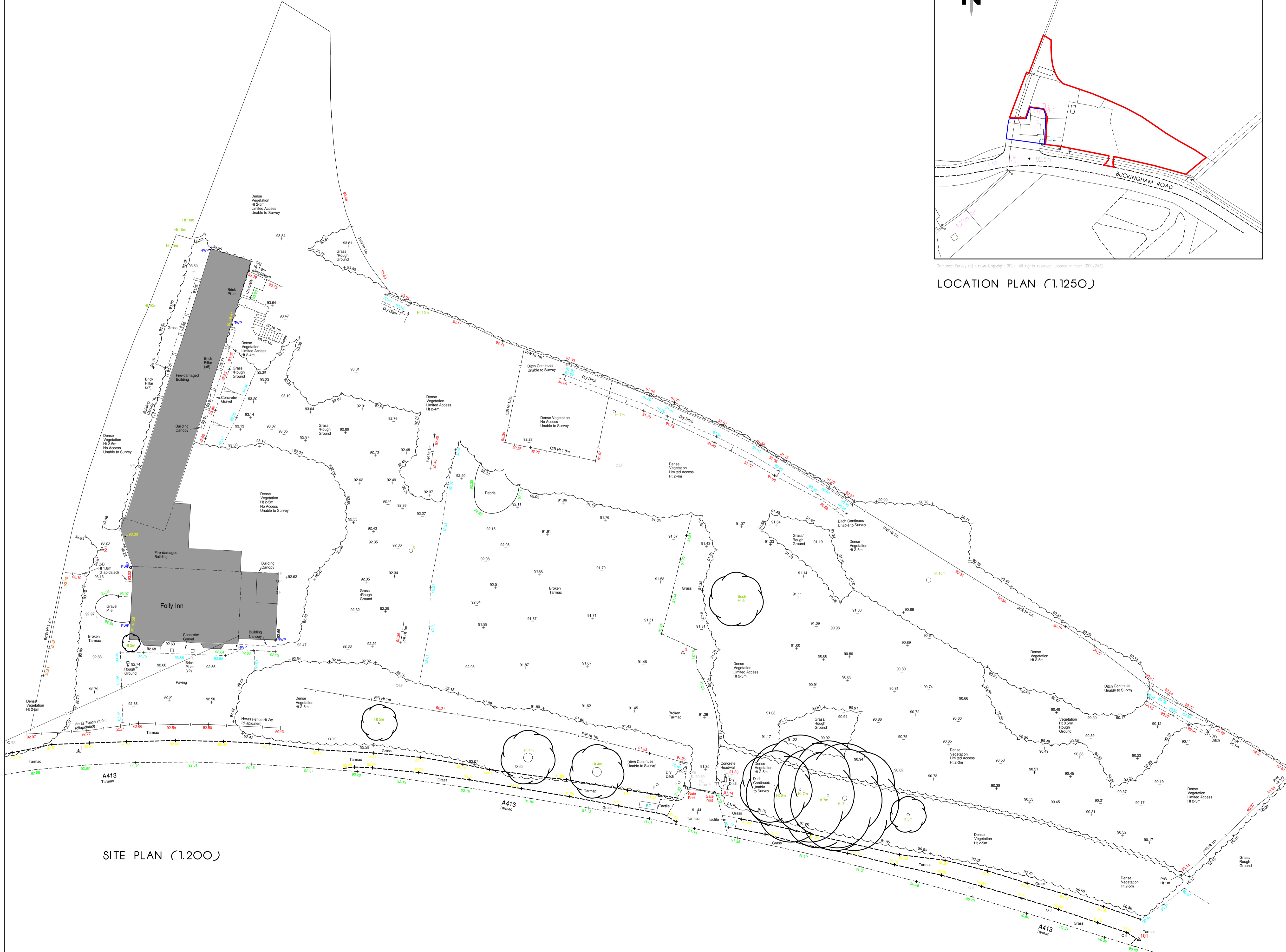
SITE PLAN (1:200)