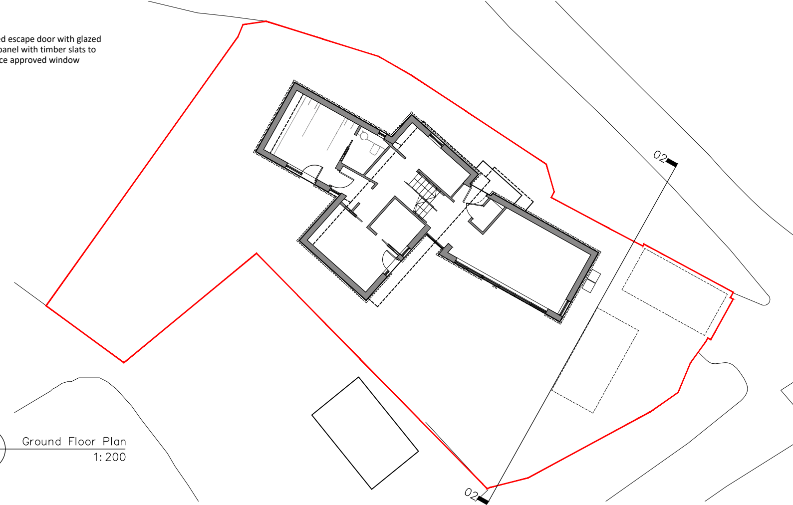
02 201 Ground Floor Plan 1:200