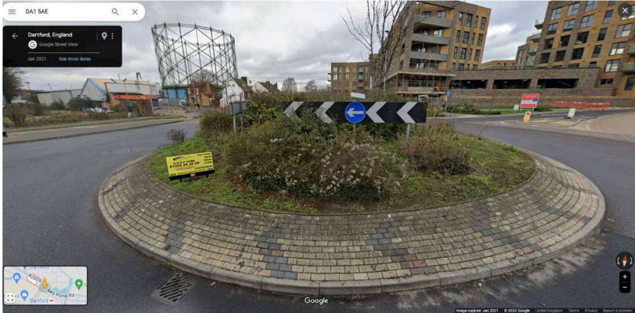
Advertisement produced by the applicant following consent 08/00721/ADV present on the roundabout between the A2026, William Mundy Way and Mill Pond Road