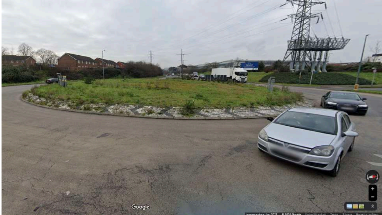
The view of the site from the East

This location has been identified by Kent County Council [the highways authority] as being suitable for sponsorship.