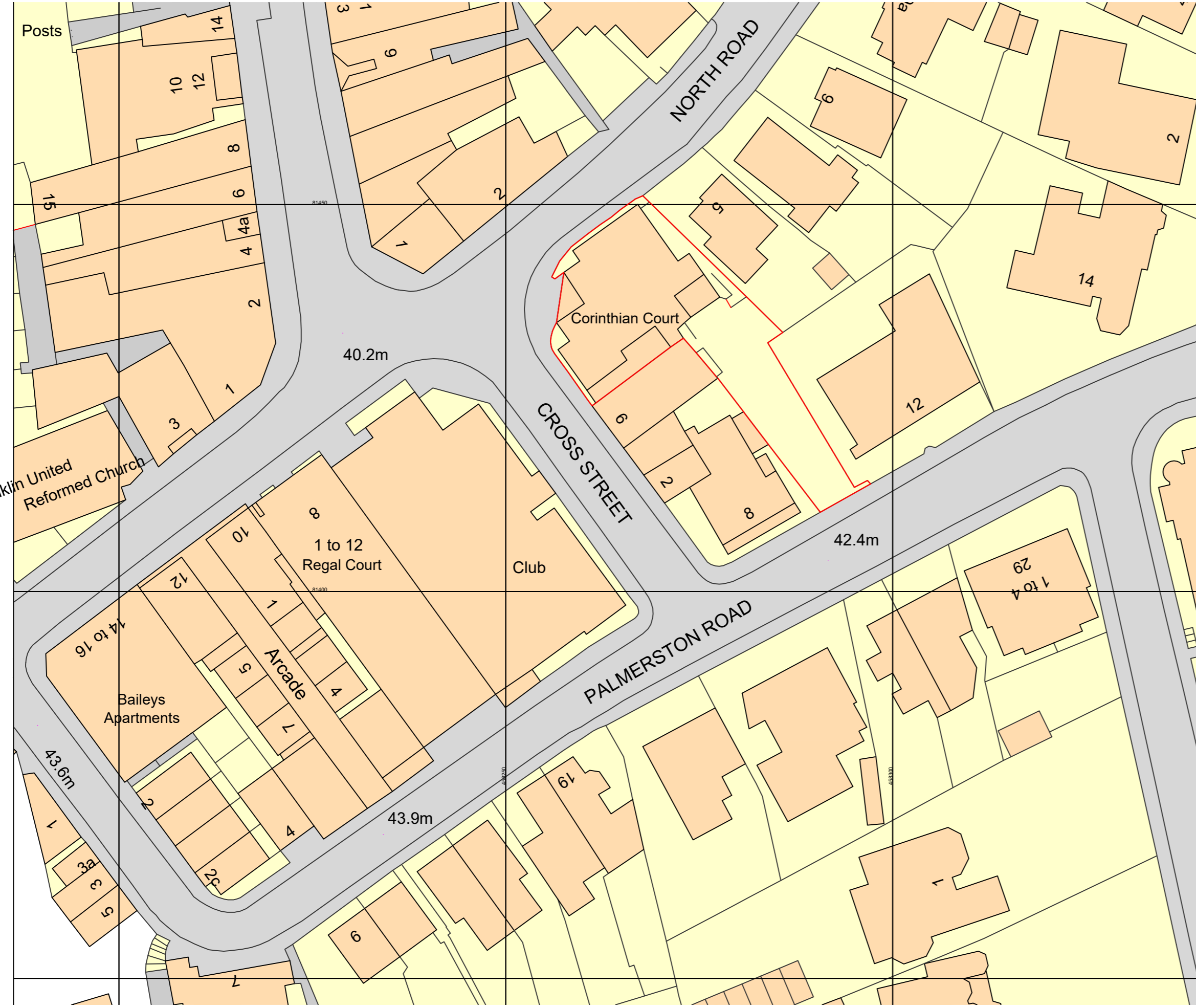
Block Plan (1:500)

Ordnance Survey. (c) Crown Copyright 2024. All rights reserved. Licence number 100022432