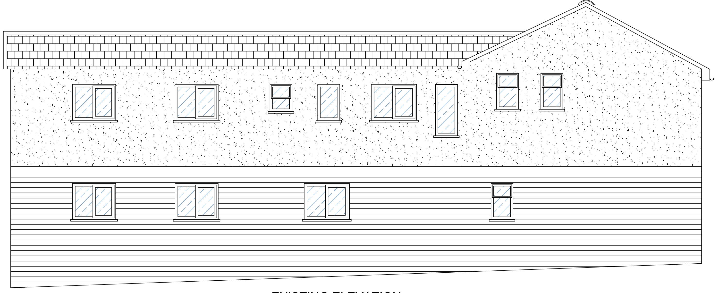
EXISTING ELEVATION VIEW FROM ACCESS ROAD