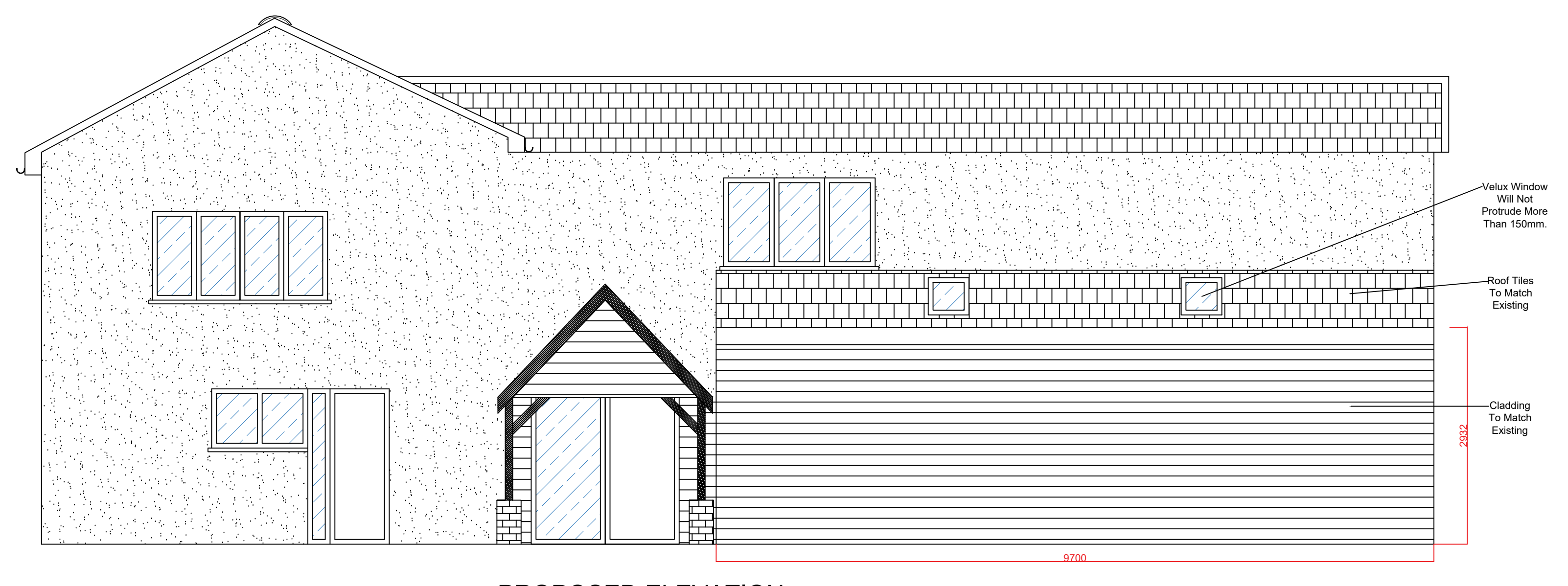
PROPOSED ELEVATION VIEW FROM 39 BRIDGE ROAD