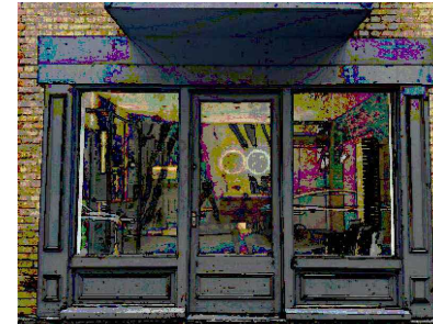
PHOTO FRONT FACADE