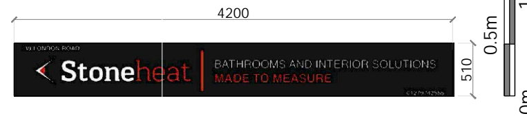
PROPOSED SIGNAGE 1:50 0m 0.5m 1m 2m