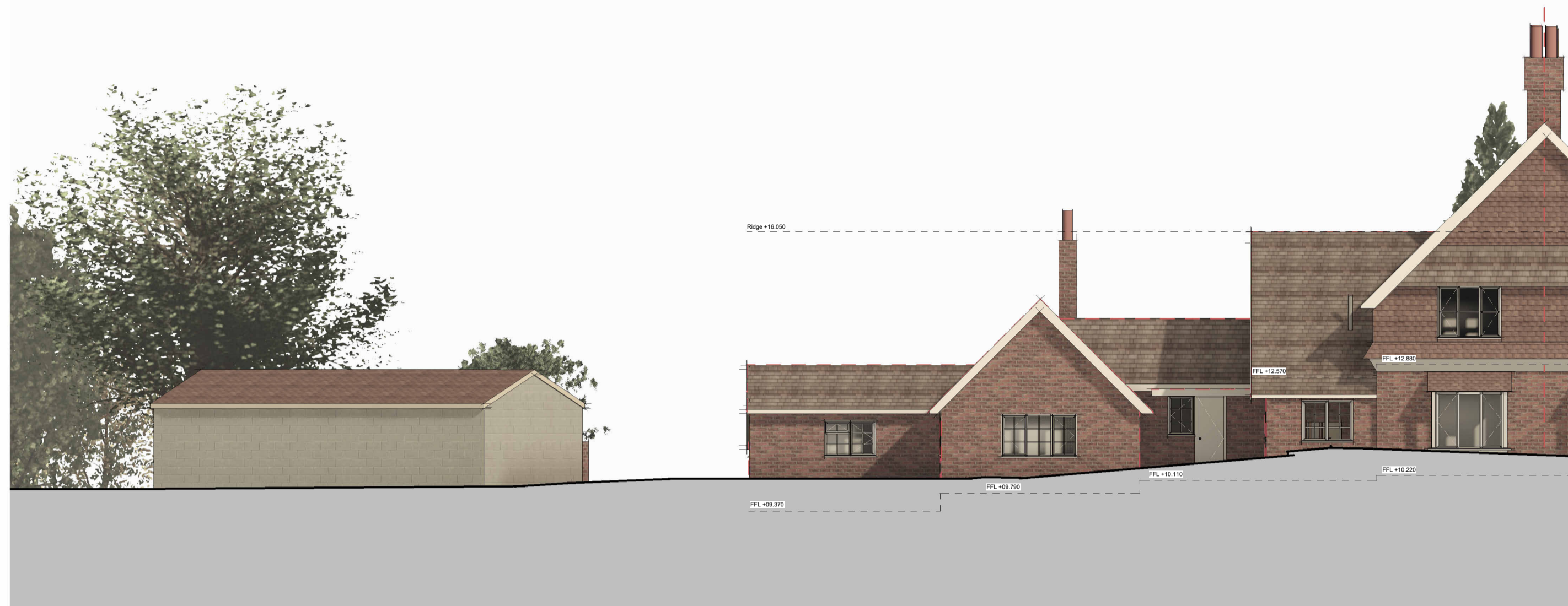
1 Existing Front Elevation 1:100 @ A1