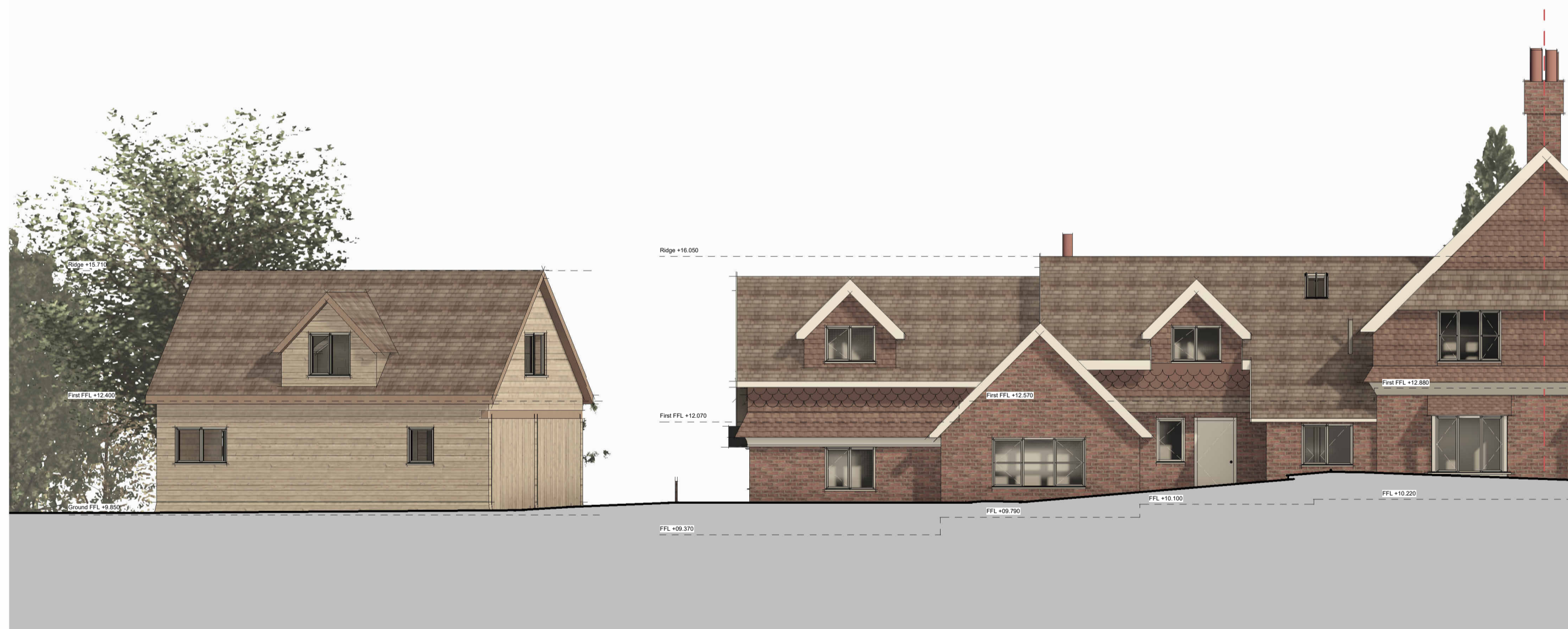
2 Proposed Front Elevation 1:100 @ A1