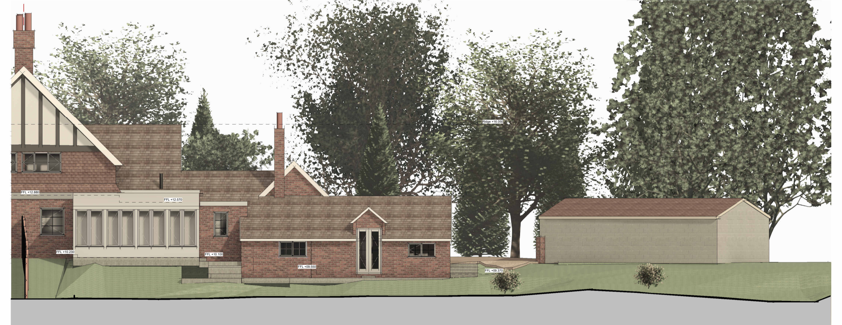
3 Existing Rear Elevation 1:100 @ A1