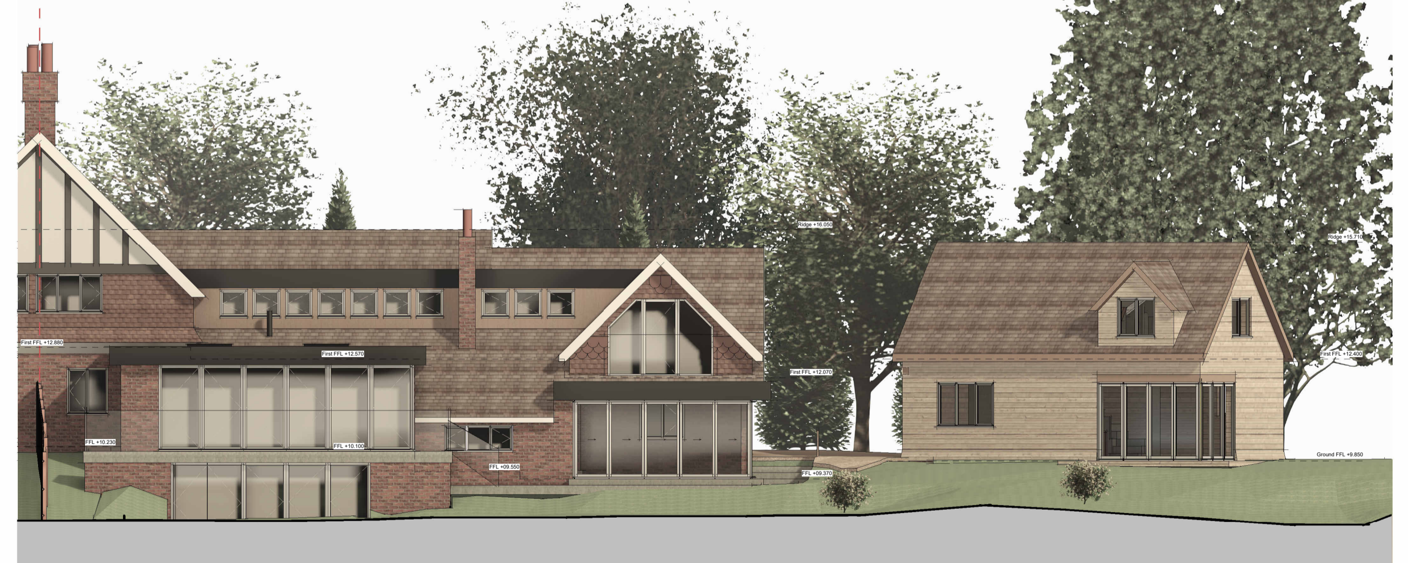
4 Proposed Rear Elevation 1:100 @ A1