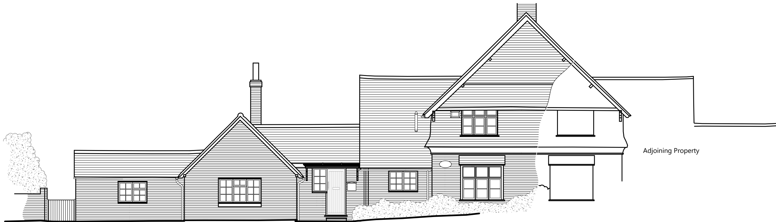
01 Front Elevation (South) SCALE 1:100@A3