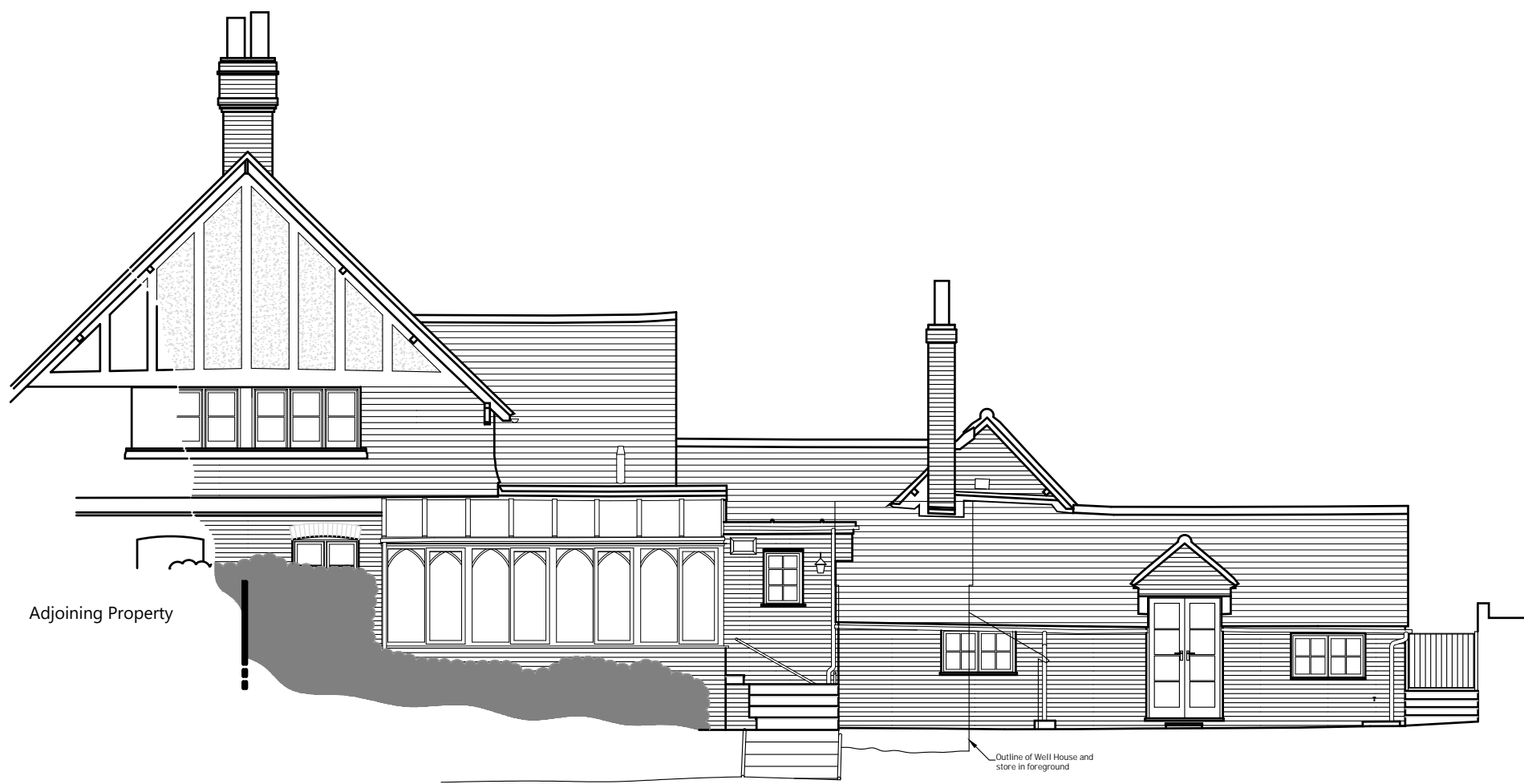
02 Rear Elevation (North) SCALE 1:100@A3