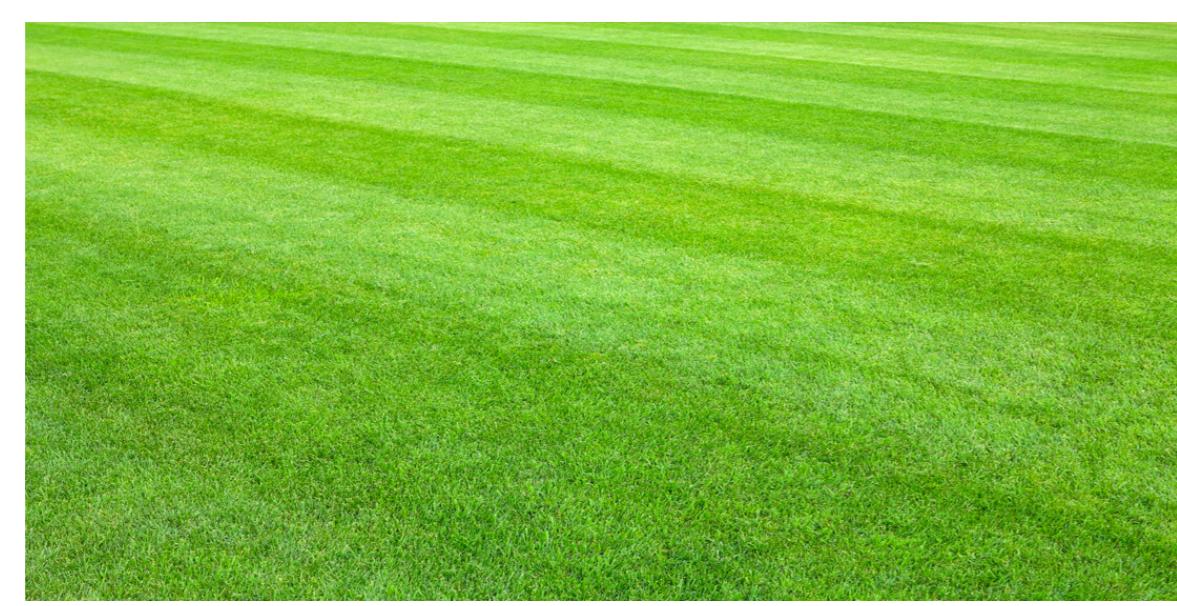
Item 11 existing lawn retained