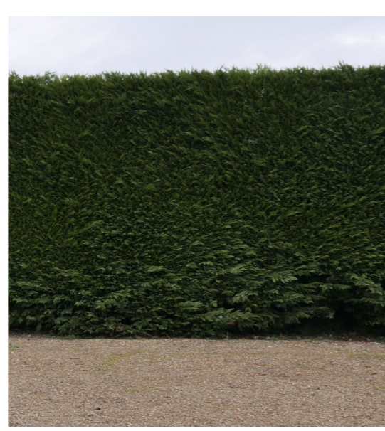
Items 2 and 3 existing gravel drive and hedge retained