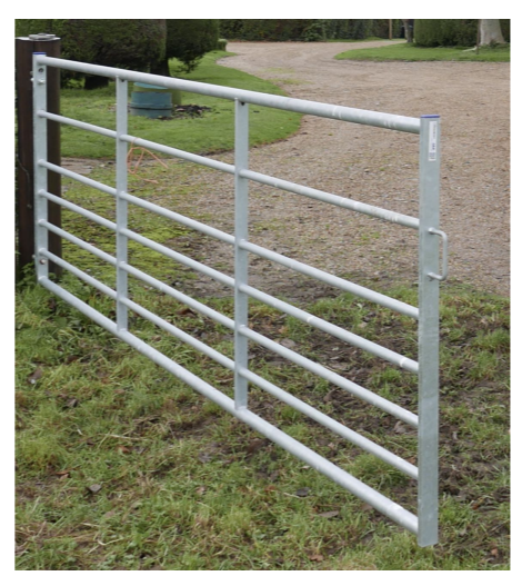
Items 4 and 5 existing galvanised gate retained with new estate fence to match