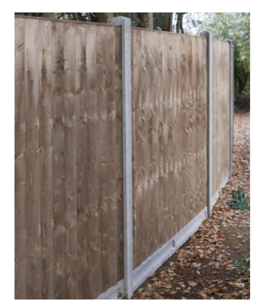
Items 14 and 15 - retained and proposed boundary fence - natural softwood featheredge panels with concrete posts