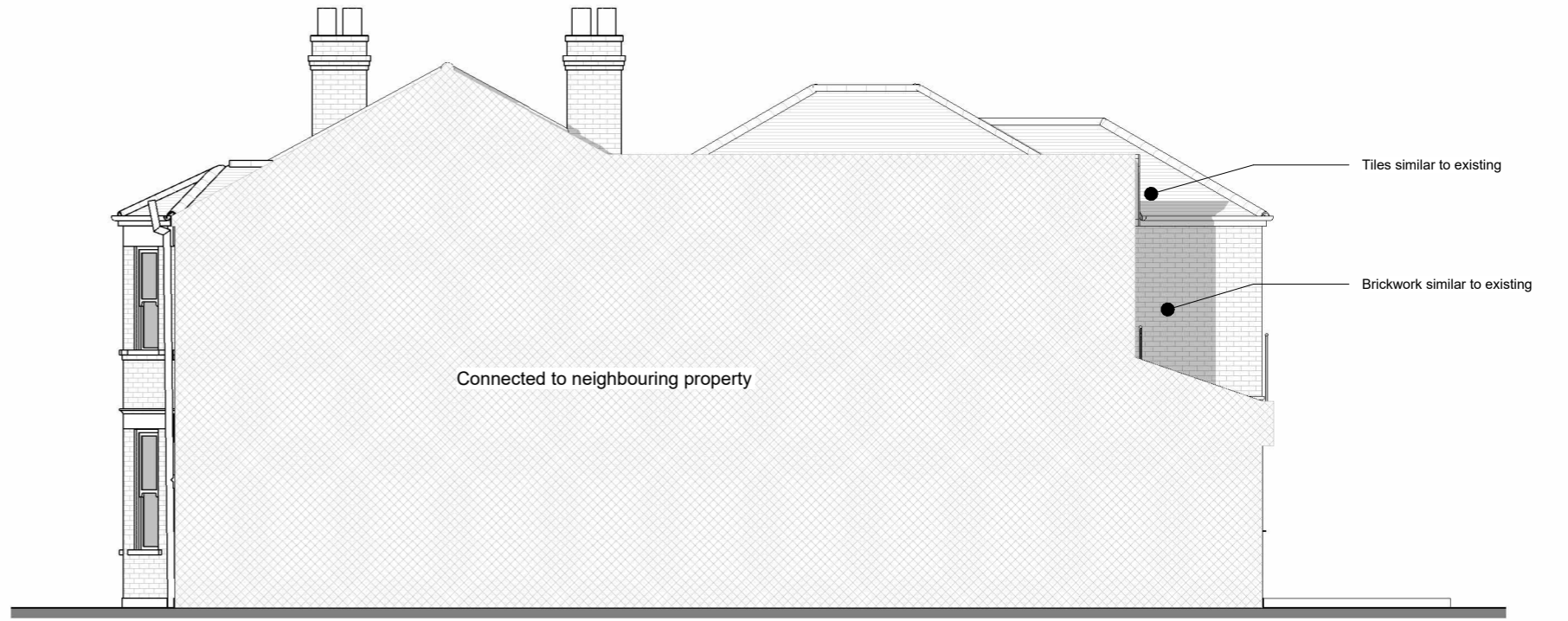
Side 2 Elevation