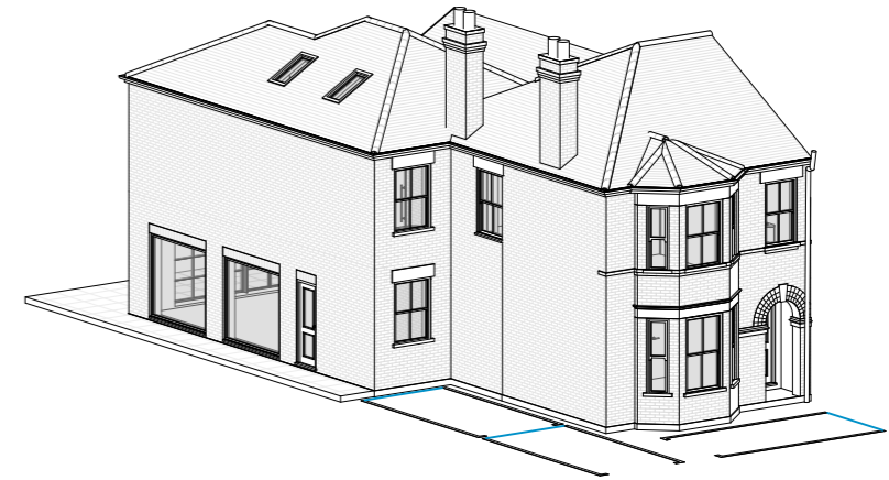
3D View 1