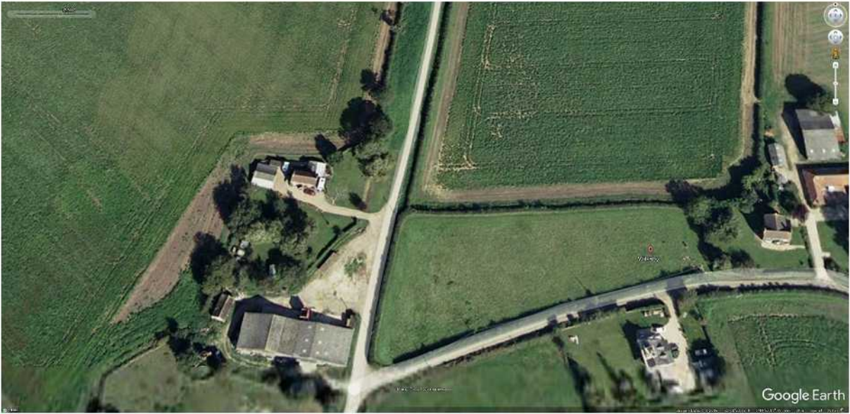
Google Earth - 2006 (December)