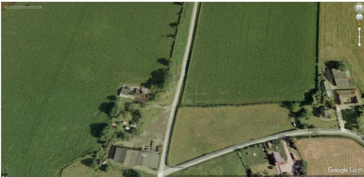
Google Earth - 2002 (December)

Satellite imagery from Google Earth has been used to show that the extension has existed longer than 10 years. The rural location has limited the number of satellite passes and street view car visits. The 1985 satellite image is such a poor resolution it is unusable to demonstrate development.