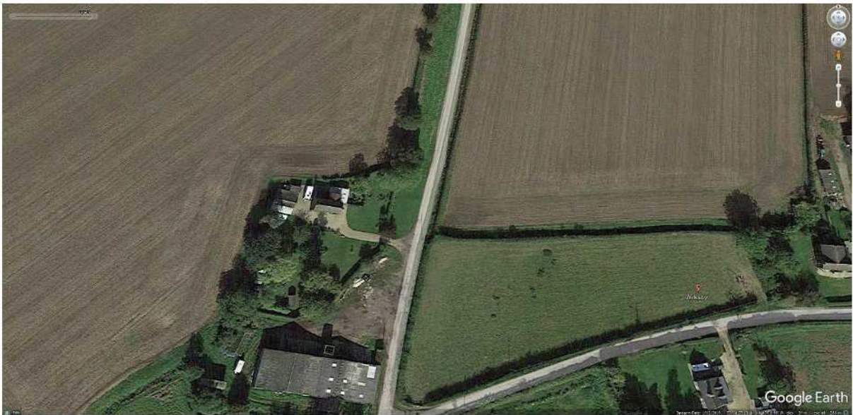
Google Earth - 2019 (October)