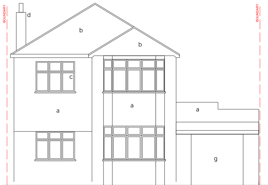
EXISTING WEST ELEVATION 1:100