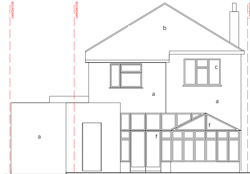
EXISTING EAST ELEVATION 1:100