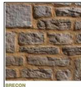
Rough Dressed (aggregate.com) in Brecon colour