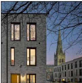
Forum Smoked Branco (wienerberger.co.uk)