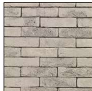
Forum Smoked Branco (wienerberger.co.uk)