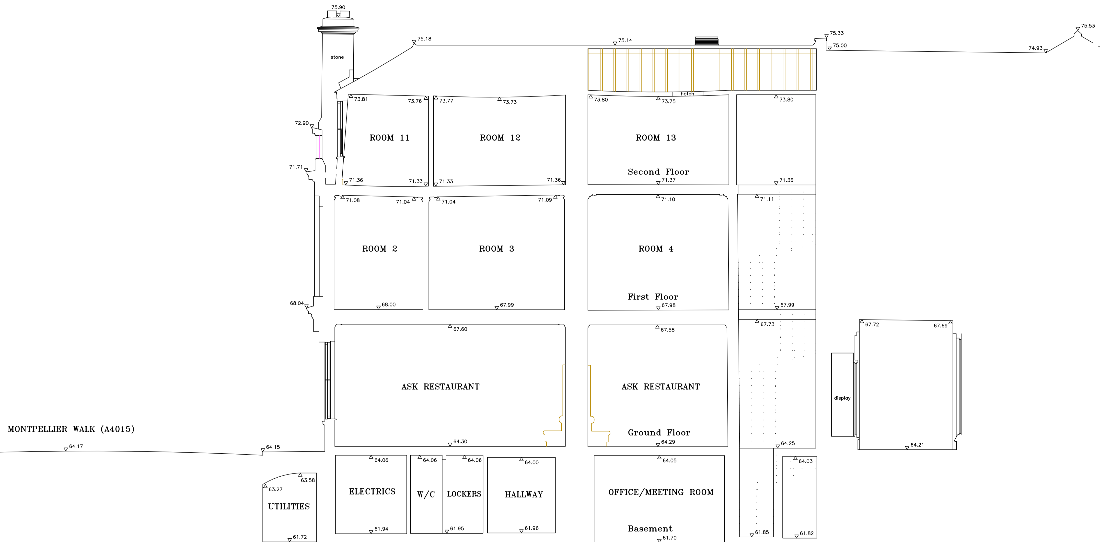
SECTION C - C