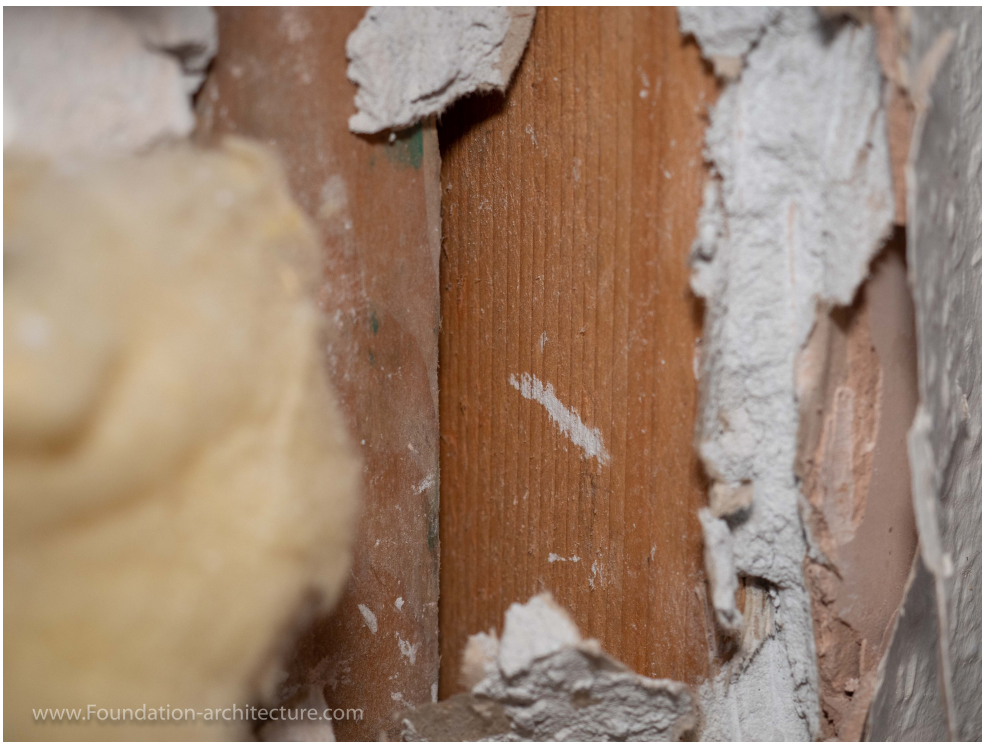
Softwood stud and fibreglass insulation detail with gypsum plasterboard facing