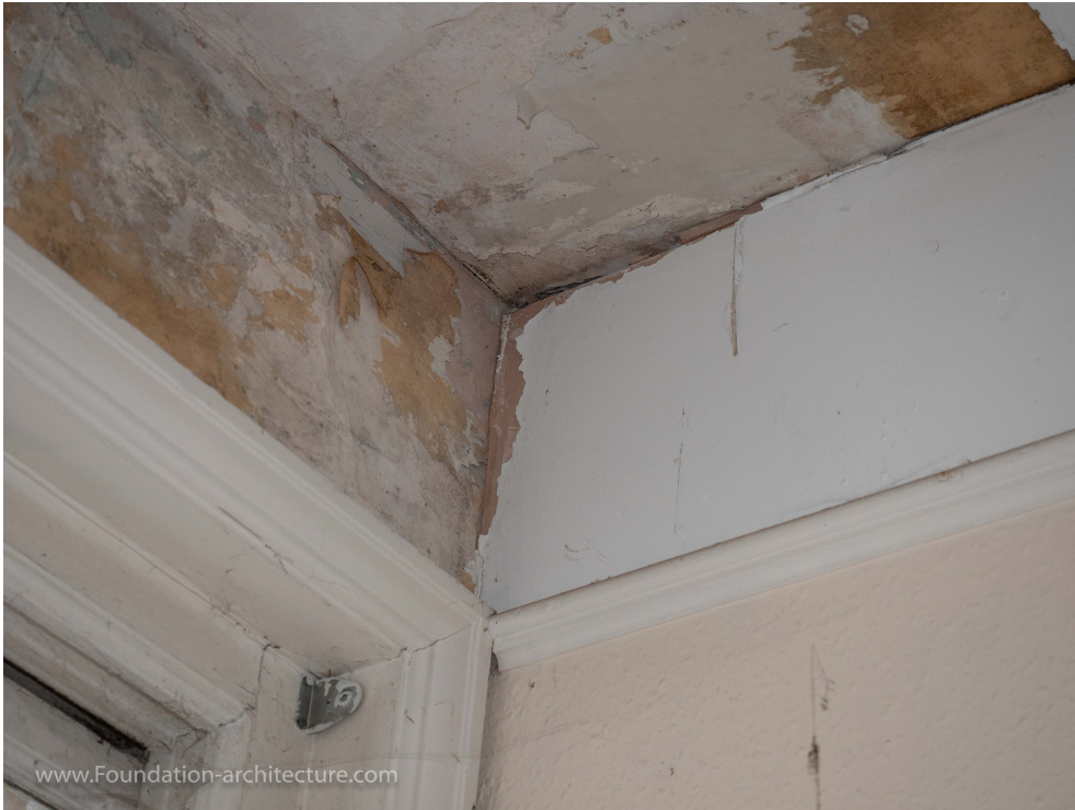
partitions inserted later within existing structure