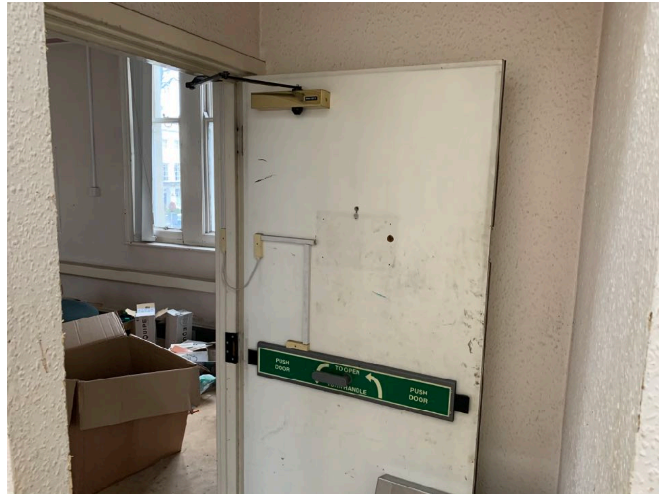
Later staircase partition construction and design first floor