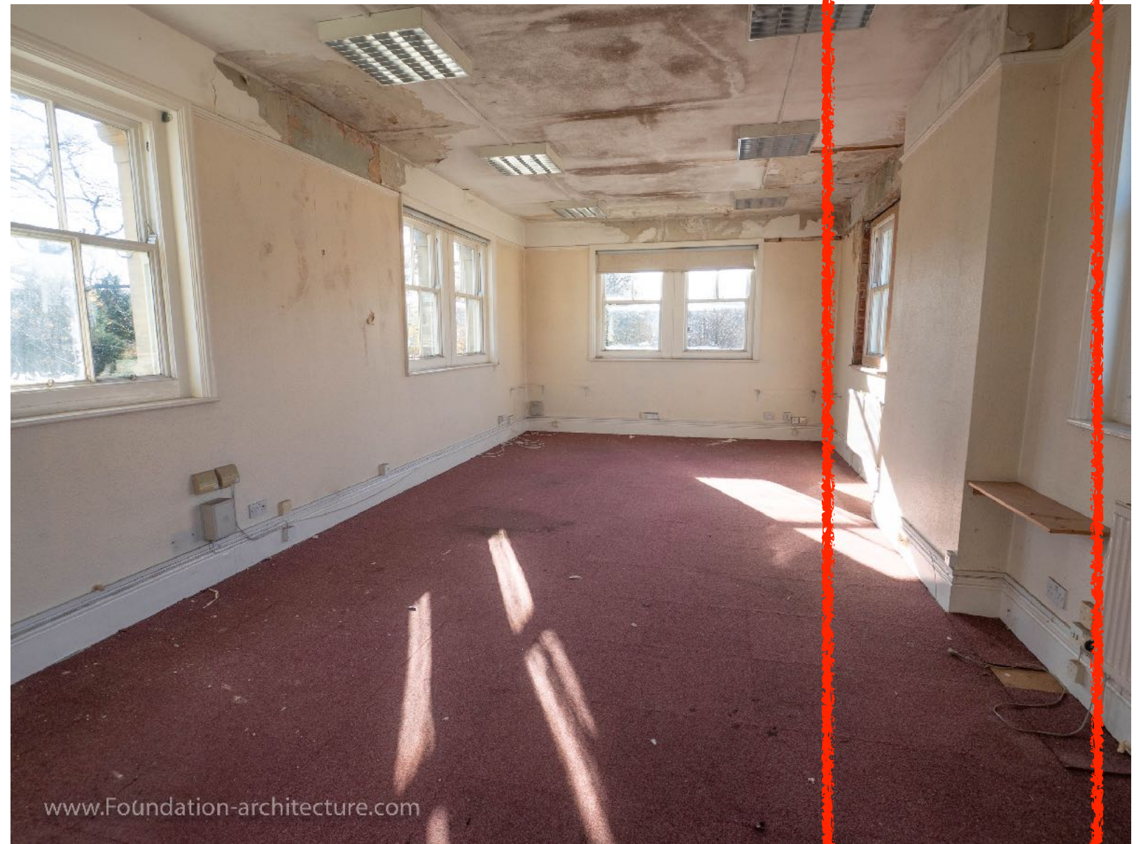
Chimney breast second floor