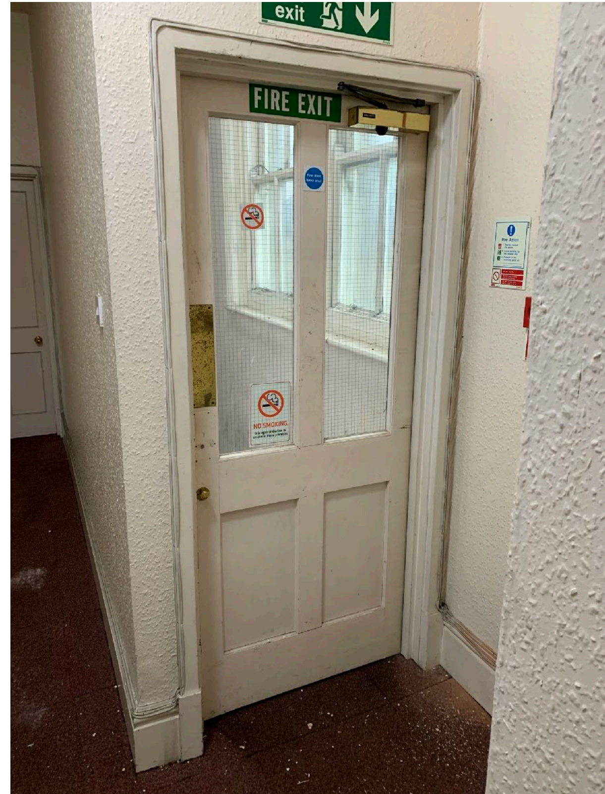
Later staircase partition construction and design Second Floor