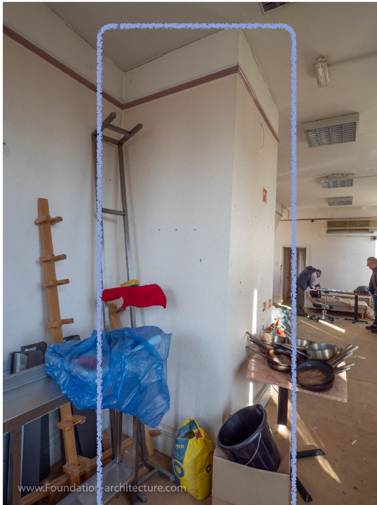
Later staircase partition construction and design