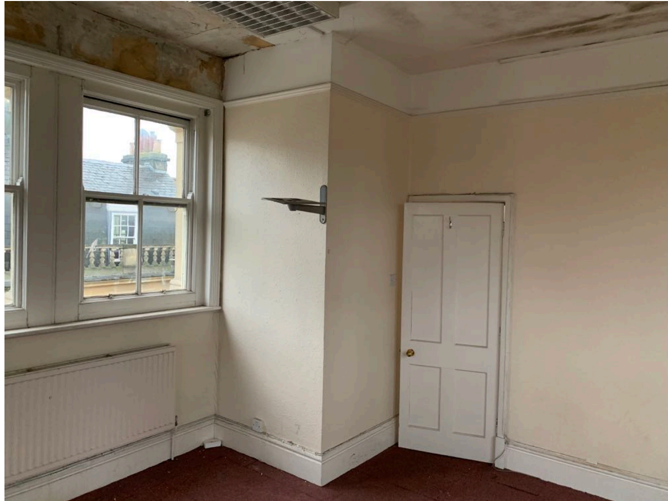
Staircase enclosure linked to wc construction second floor