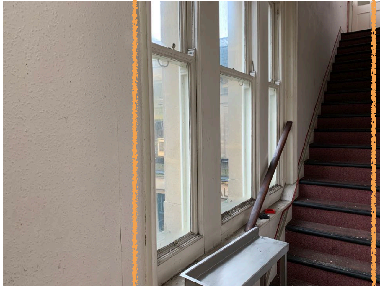
Staircase built in front of window an unlikely original detail by any architect