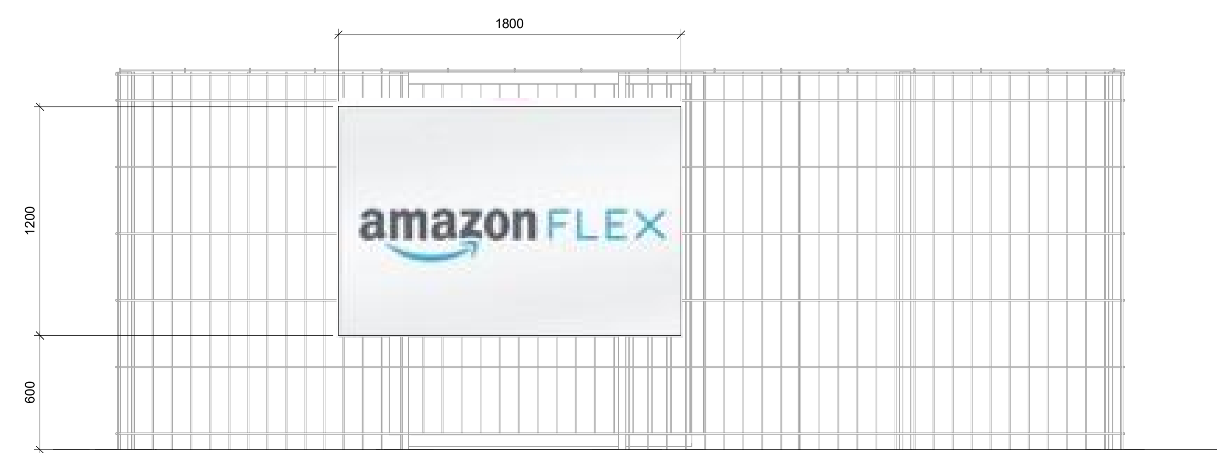
SALLY PORT MOUNTED