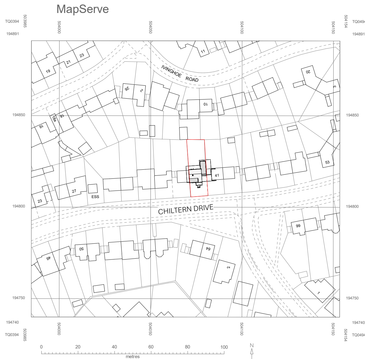
2 BL-301 Rev2 SITE (Location) Proposed 1 : 1250