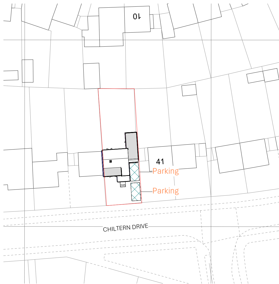
1 BL-301 Rev2 SITE (Block) Proposed 1 : 500