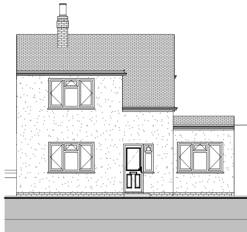
1 EP-303 Rev2 FRONT (EXISTING) 1 : 100