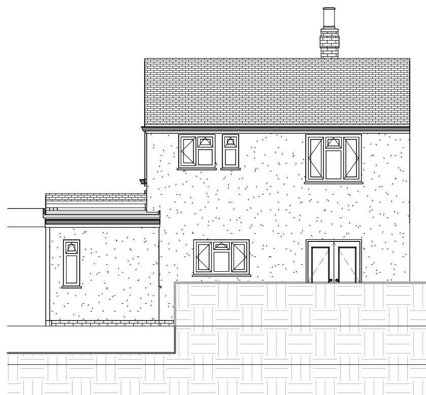
4 EP-303 Rev2 REAR (PROPOSED) 1 : 100