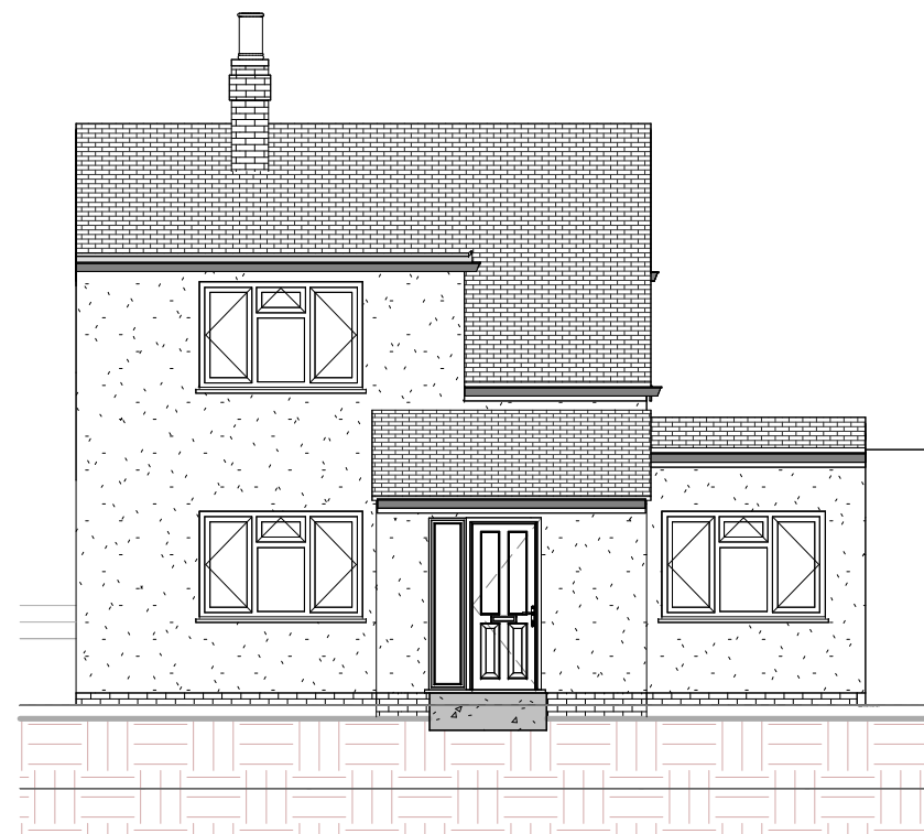
2 EP-303 Rev2 FRONT (PROPOSED) 1 : 100