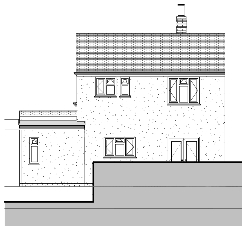
3 EP-303 Rev2 REAR (EXISTING) 1 : 100