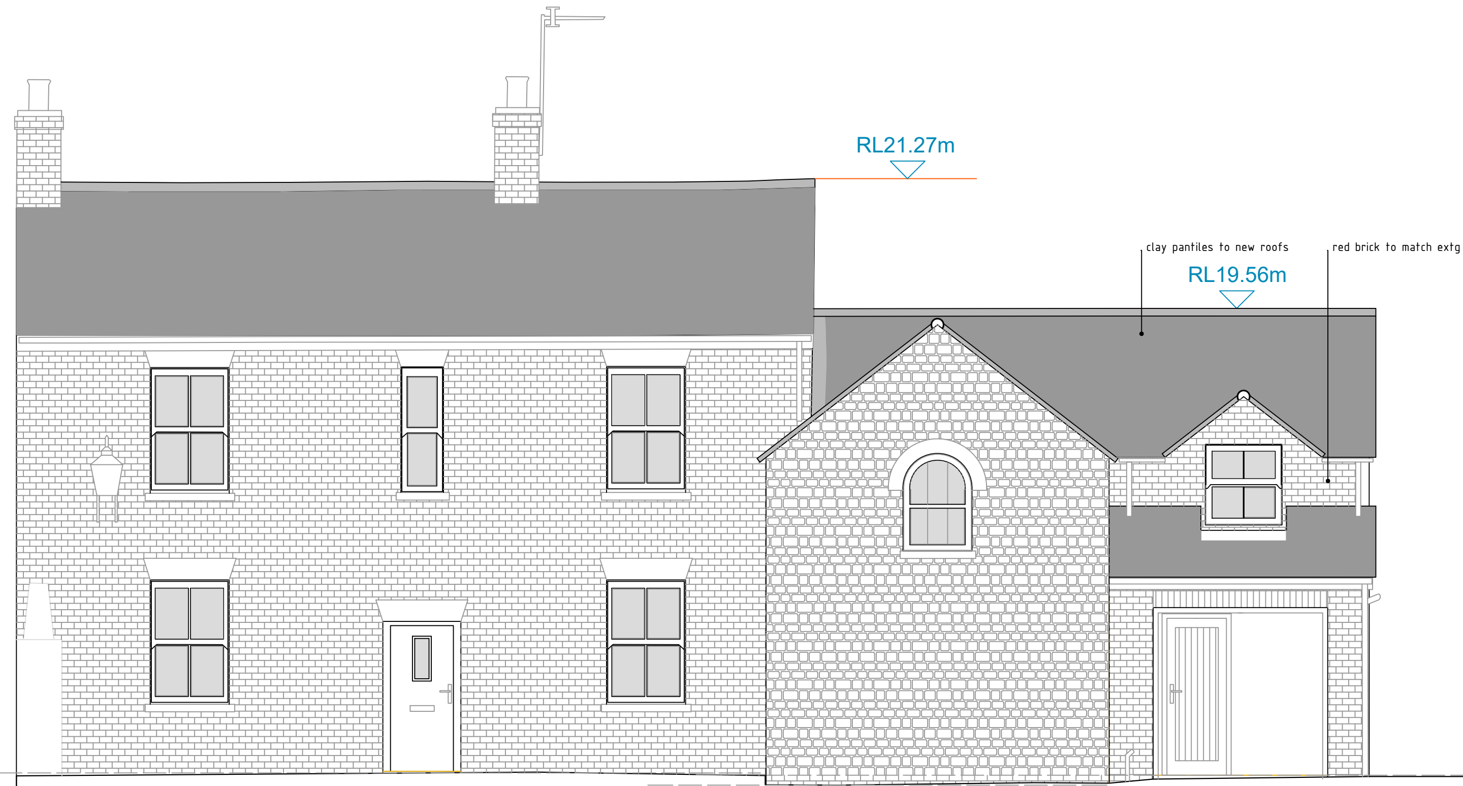
proposed south elevation scale 1:50