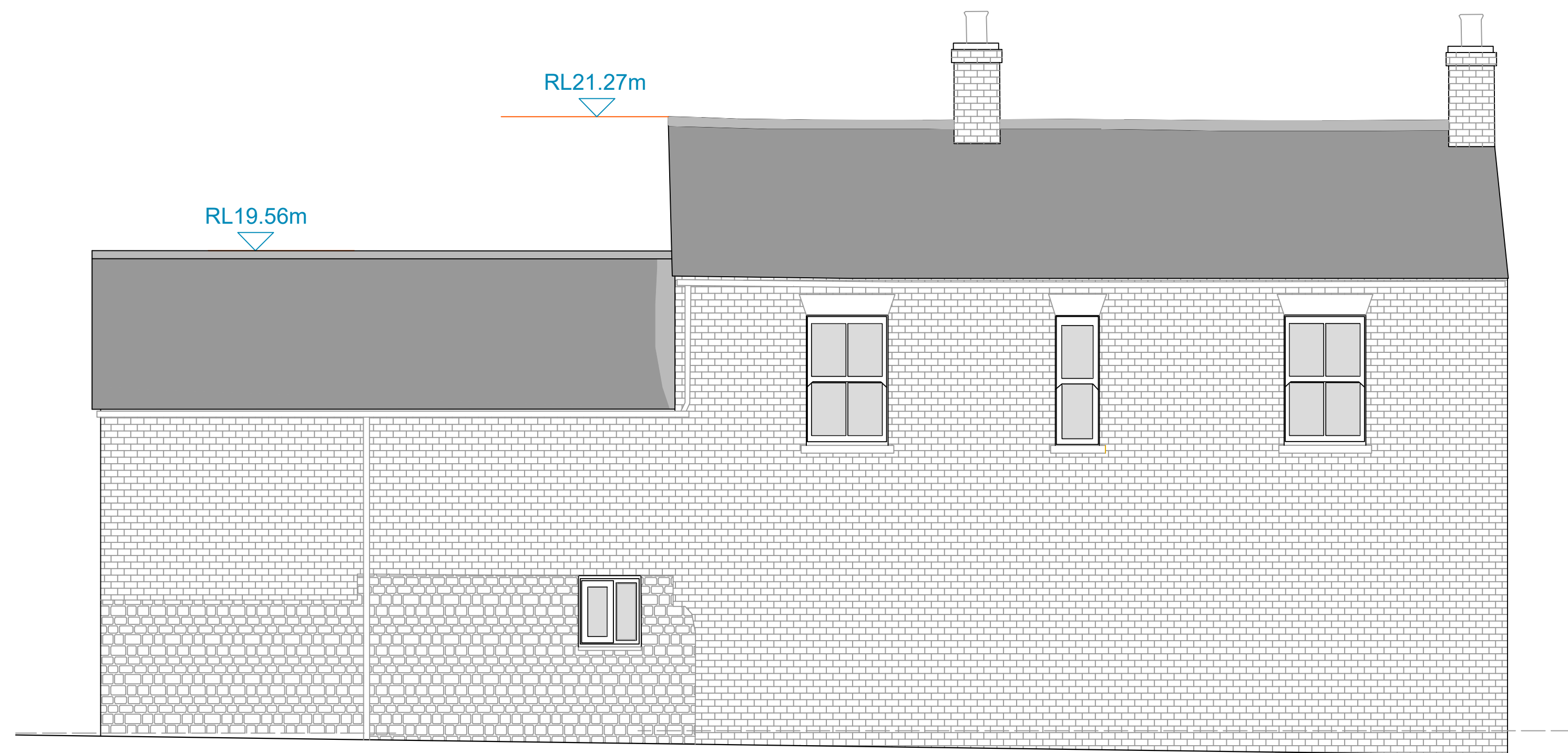
proposed north elevation scale 1:50