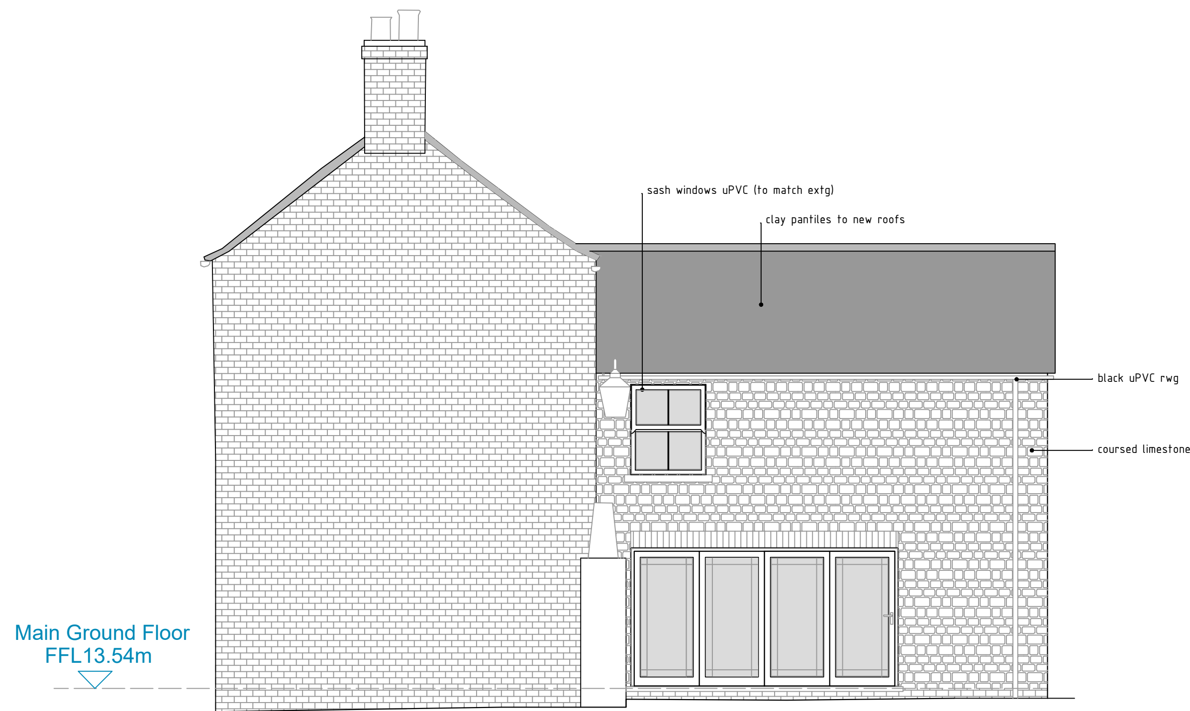
proposed west elevation scale 1:50