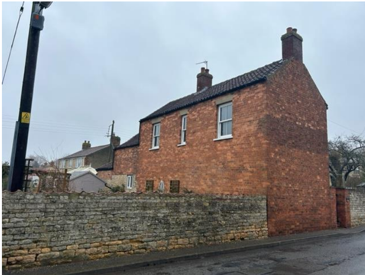
Stone boundary wall to west