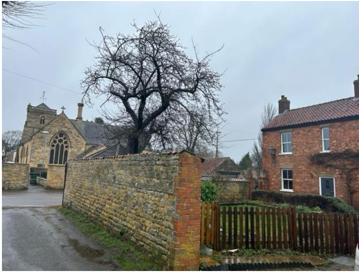
Stone boundary wall to south with Grade II listed building beyond