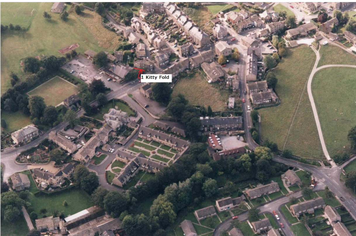
Figure 7: Aerial photograph from 1990 of 1 Kitty Fold, sourced from www.photoarchive.addingham.info . Edited to highlight 1 Kitty Fold.