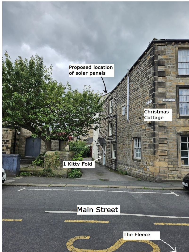
Figure 3: View of 1 Kitty Fold from The Fleece, taken 24 th July 2023.

Located immediately across from 1 Kitty Fold is The Fleece pub, a Grade II Listed Building dating back to the mid-18 th century and which has retained a number of its historical features. The view from The Fleece down Kitty Fold has been highlighted within Addingham's Conservation Area as one of the key views within the area. This is visible in Figure 4 on page 5. This key vista from The Fleece can be seen below in Figure 3. Figure 3 identifies that, due to the shallow aspect of the roof of the second floor extension, there is limited visibility onto the roof. This is the section of roof where the proposed solar panels will be placed.