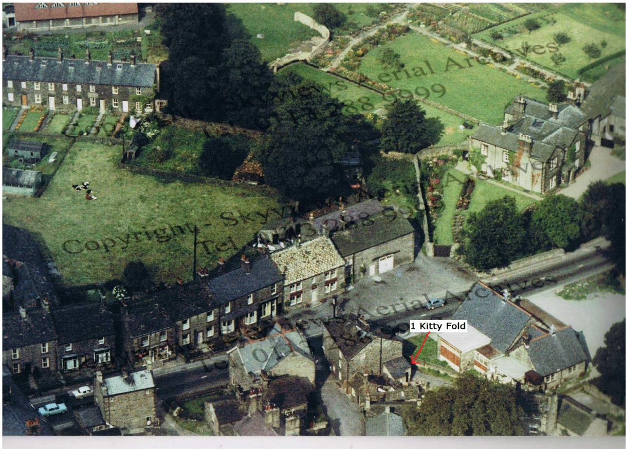
Figure 6: Aerial photograph from 1964 of 1 Kitty Fold, sourced from www.photoarchive.addingham.info . Edited to highlight 1 Kitty Fold.