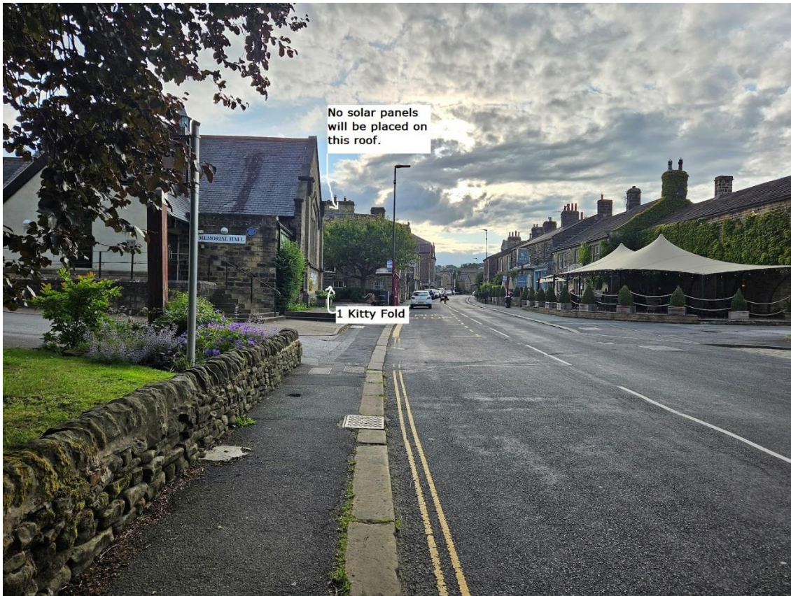
Figure 1: View of 1 Kitty Fold from Main Street, taken 24 th July 2023.