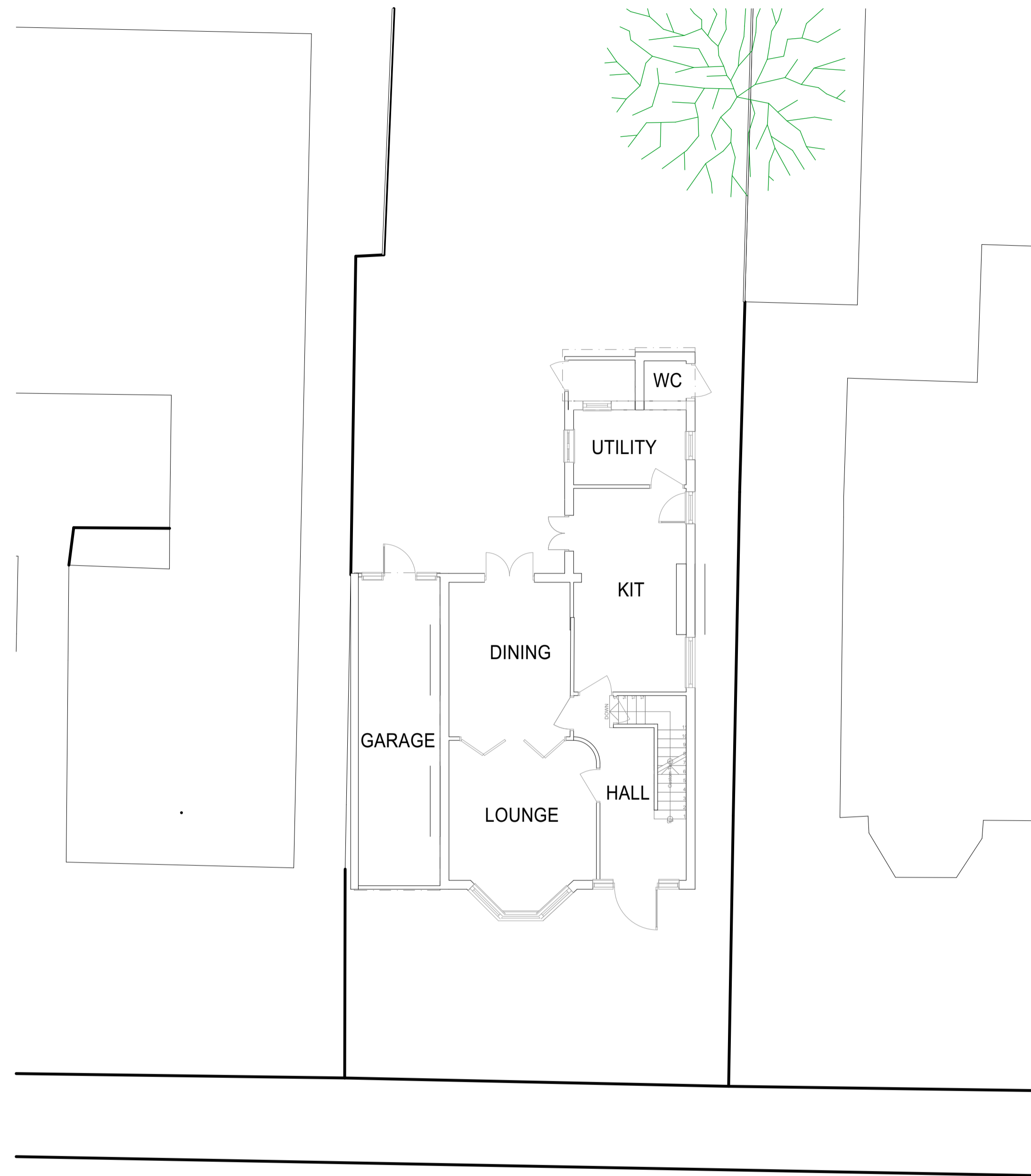
0. GROUND FLOOR PLAN