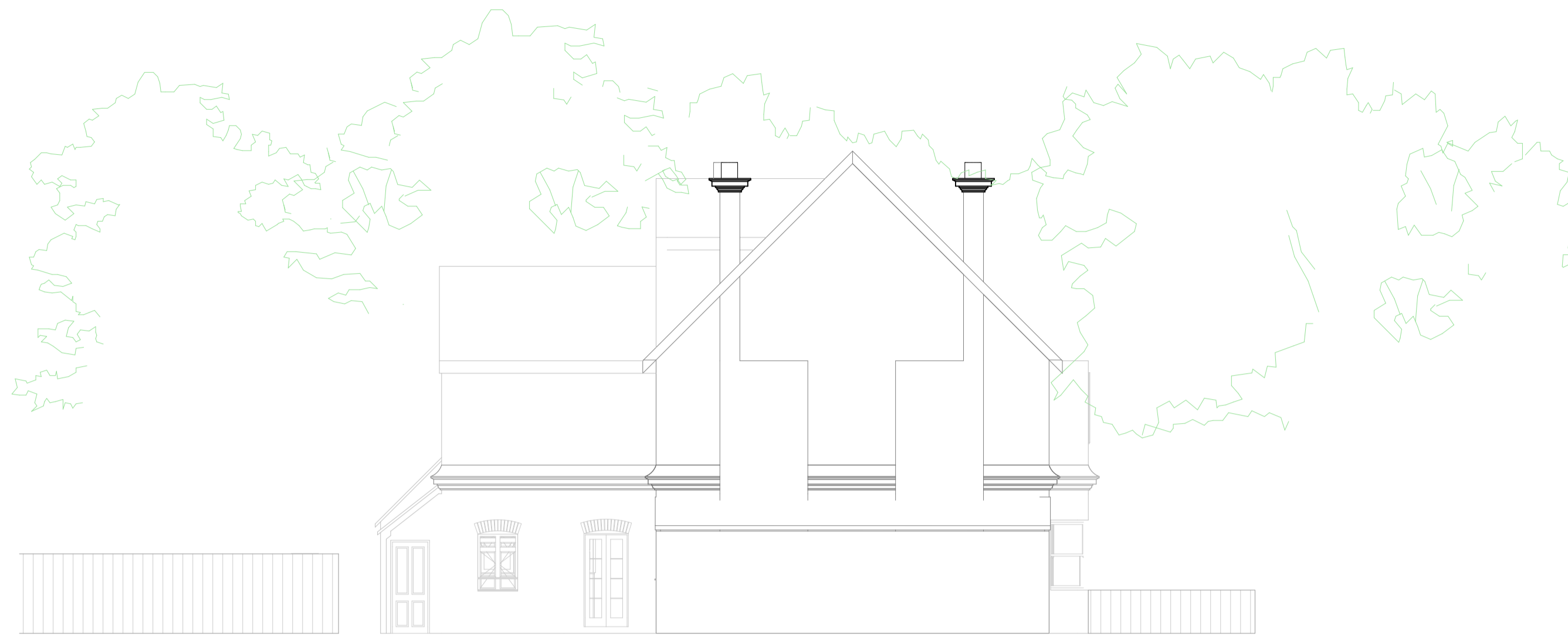
E-01 Side Elevation (South)