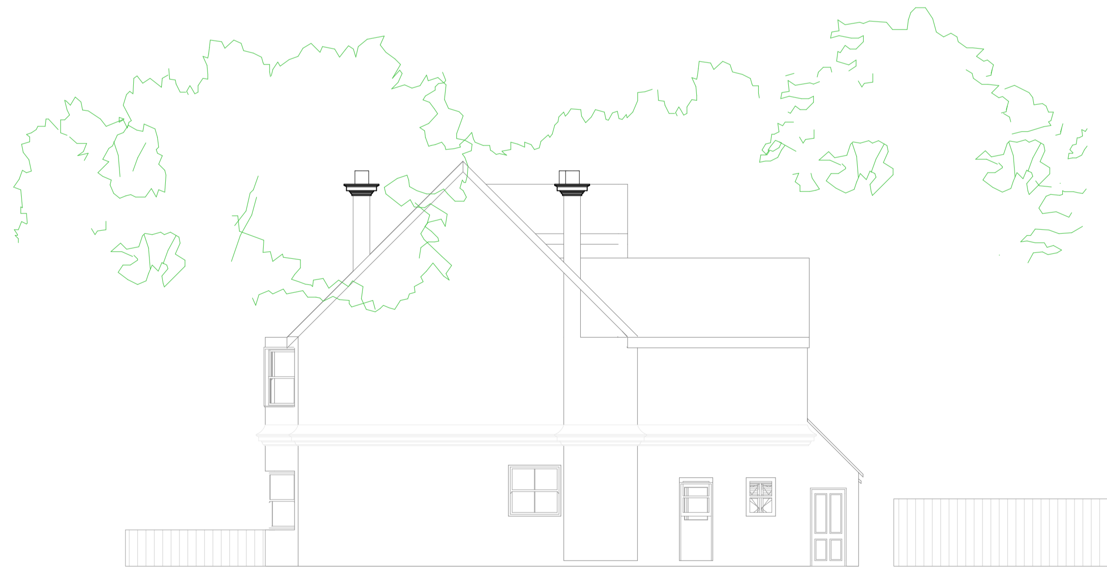
E-03 Side Elevation (North)