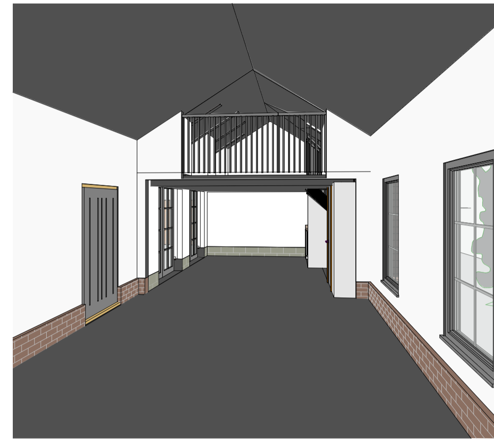
2 view towards mezzanine