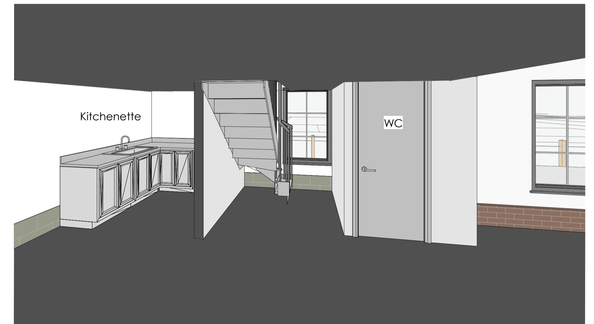
4 3D View 5