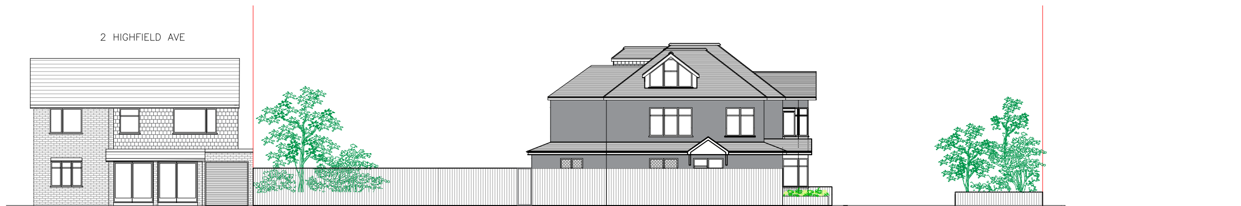
PROPOSED SIDE: PROPOSED SIDE

GENERAL NOTES 1. All dimensions in millimetres (mm). 2. Mains operated smoke alarms to all landings. In series and battery back up. 3. Dimension are to be obtained on site and not scaled off this plan applied for contractor only. 4. Finished room dimensions may vary to those stated on this plan. 5. Work although specified may not be part of the agreed schedule of works/contract. 6. Any changes to this drawing must be advised/consulted by the Architect or Building Control Officer/Planning as applicable. 7. Party Wall Agreements are deemed to be the responsibility of the client unless the Architect is specifically appointed under a separate agreement to undertake such matters. 8. It is the responsibility of the client to wait for full planning permission and full building regulations to be granted before any work start. 9. All structural members are calculated without the length of the bearing. It is the responsibility of the contractor to measure the required length of any structural member on site.