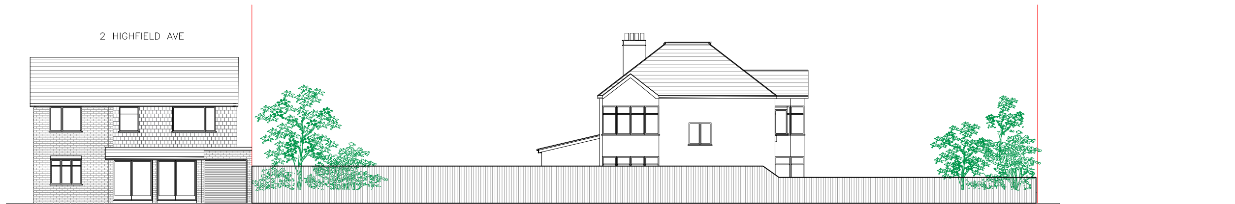
STREET SCENE :: EXISTING SIDE