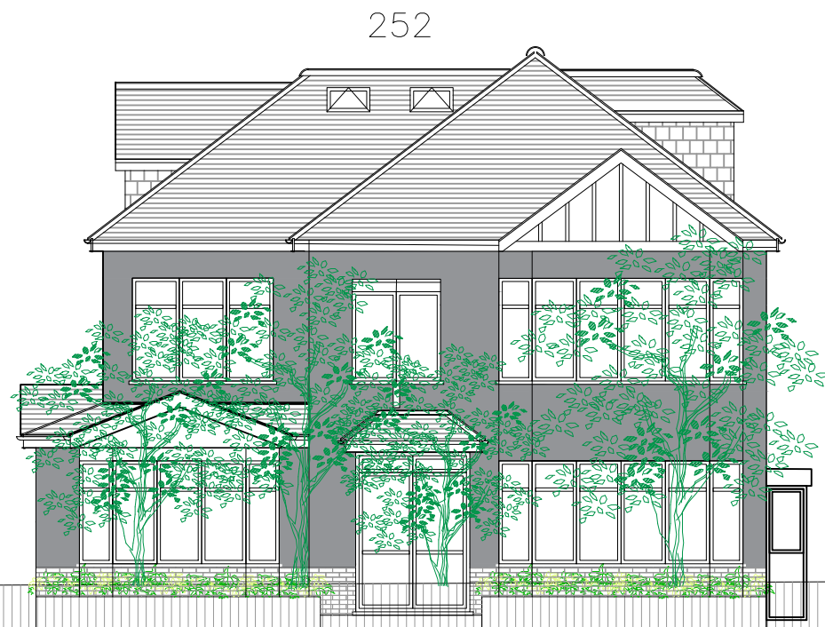
STREET SCENE : PROPOSED FRONT