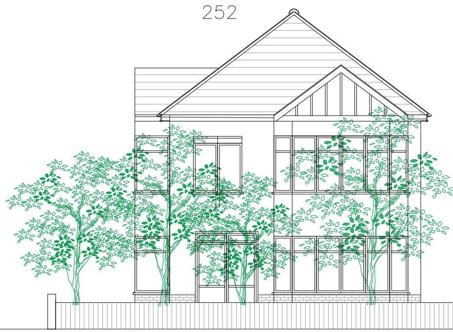
STREET SCENE : EXISTING FRONT