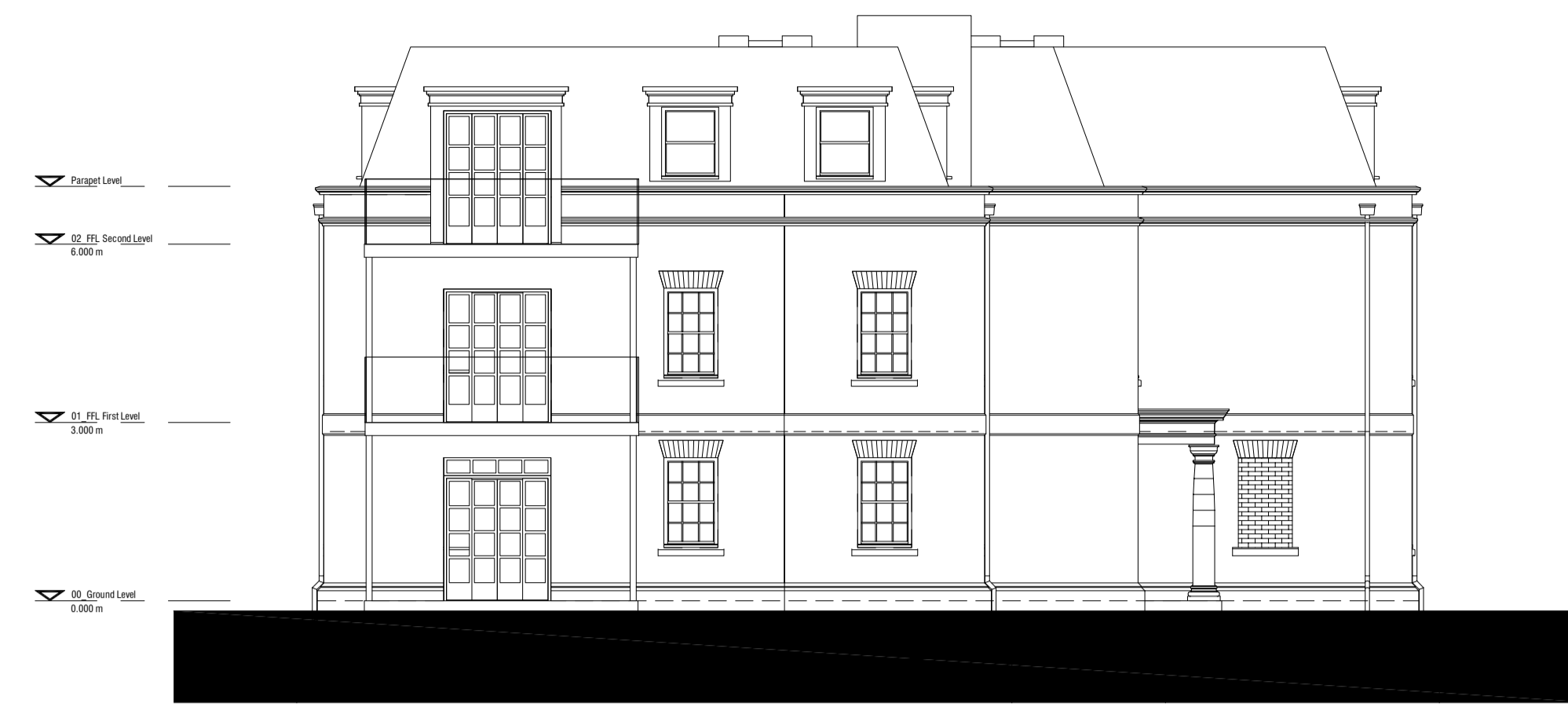
Rear Elevation (BB) 1.100 @ A1