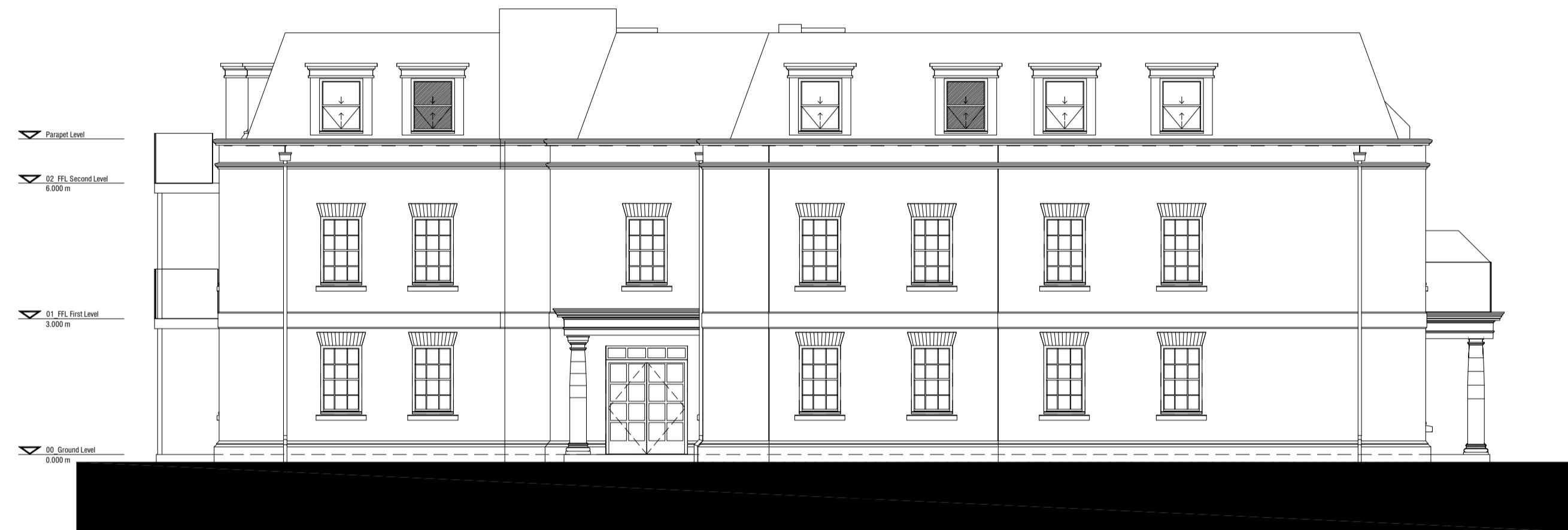
Side Elevation (CC) 1.100 @ A1