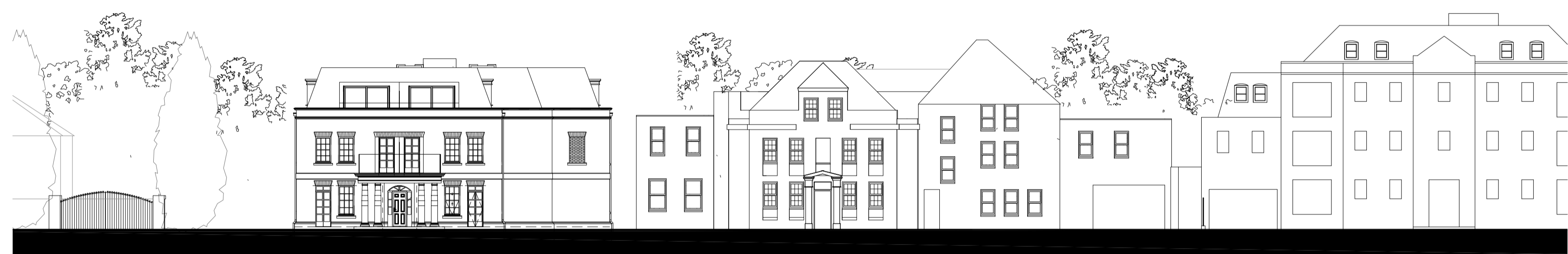
Street scene 1.200 @ A1