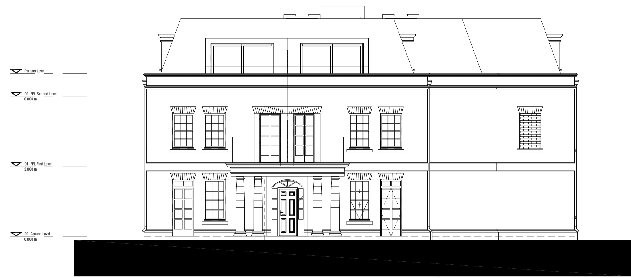
Front Elevation (AA) 1.100 @ A1

DO NOT SCALE from this drawing Contractors must verify all dimensions on site before setting out, commencing work, or making any shop drawings.