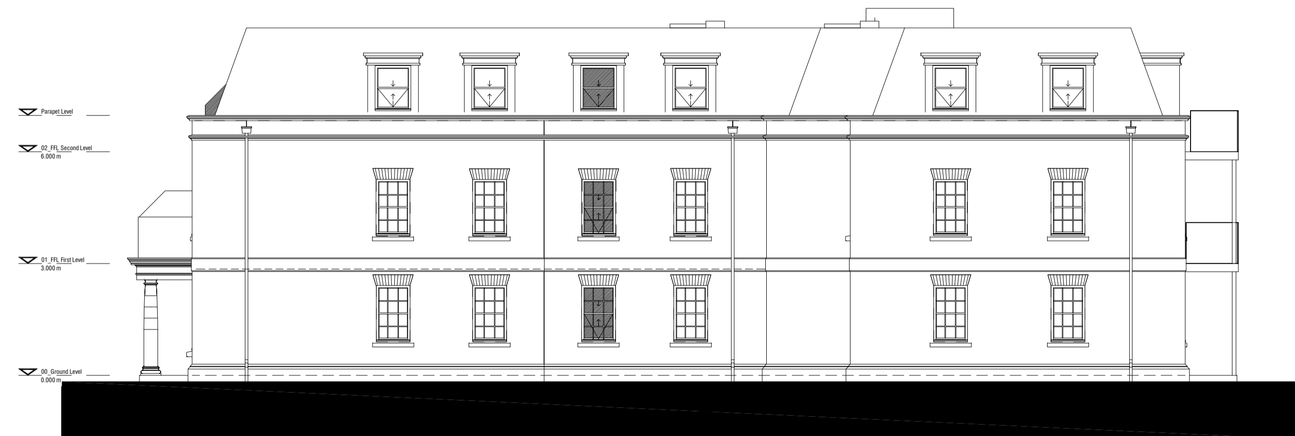
Flank Elevation (DD) 1.100 @ A1