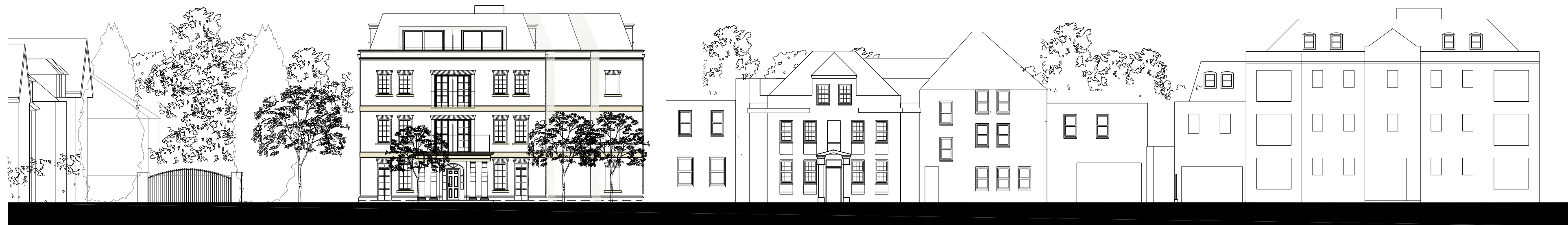
Proposed Street Scene 1:200 @ A1