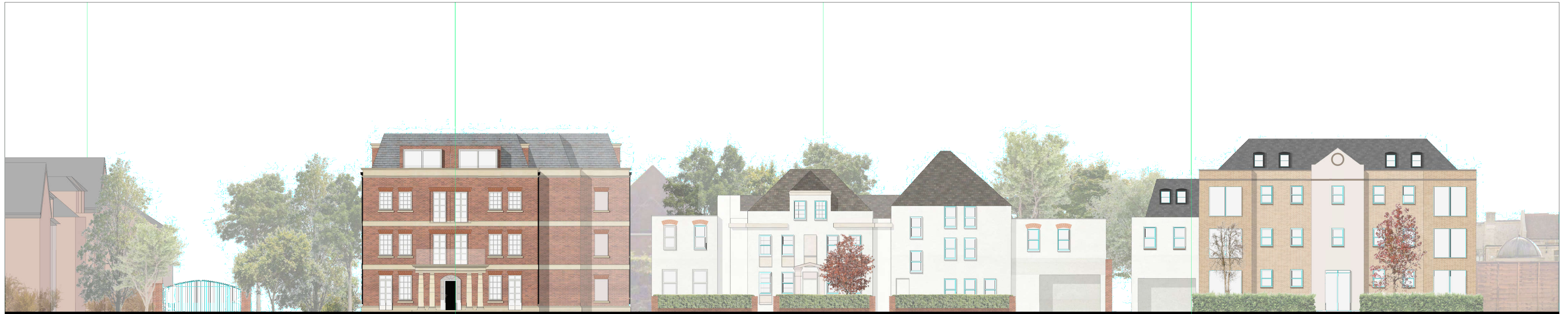
Proposed Street Scene NTS

DO NOT SCALE from this drawing Contractors must verify all dimensions on site before setting out, commencing work, or making any shop drawings.