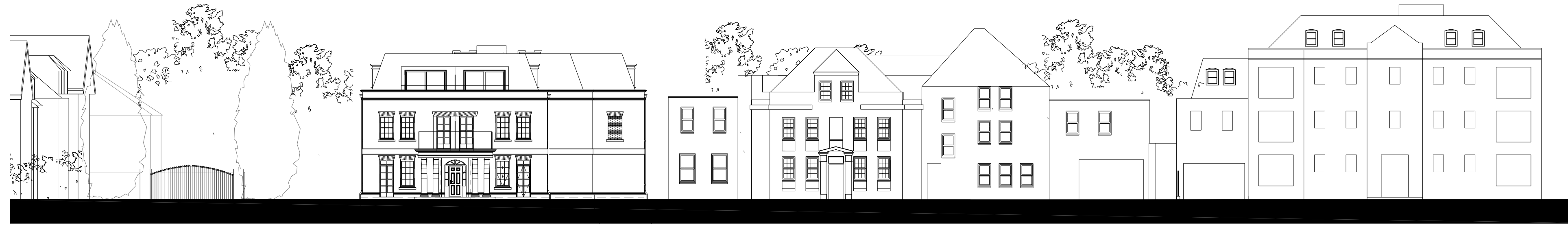
Planning Approved Street Scene 1:200 @ A1