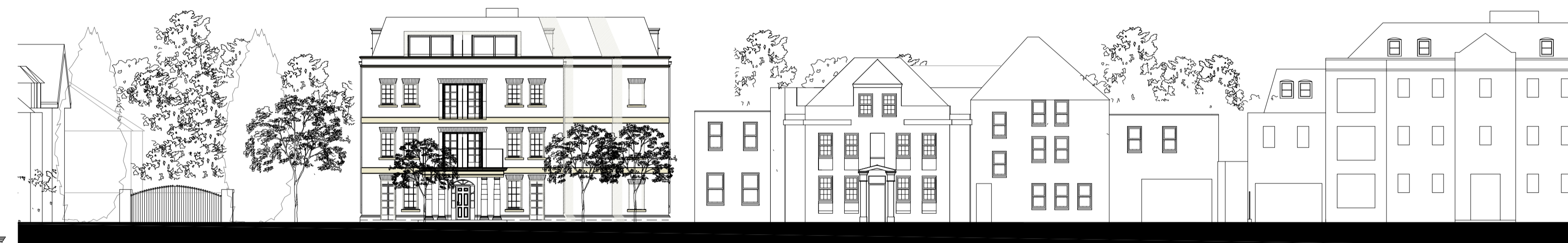
Street Scene 1.200 @ A1