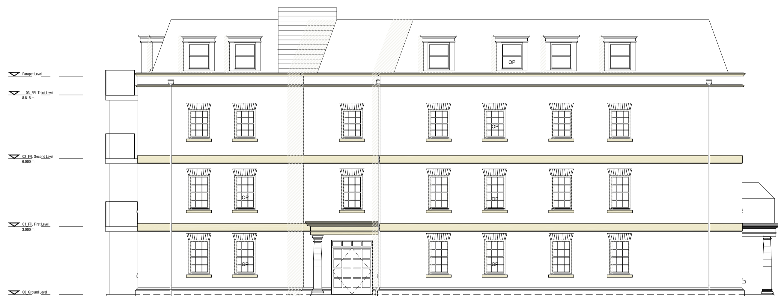
Side Elevation (CC) 1.100 @ A1