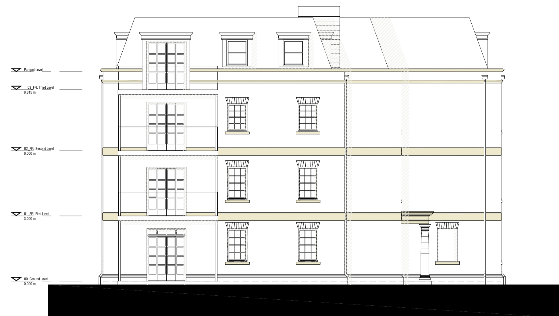
Rear Elevation (BB) 1.100 @ A1