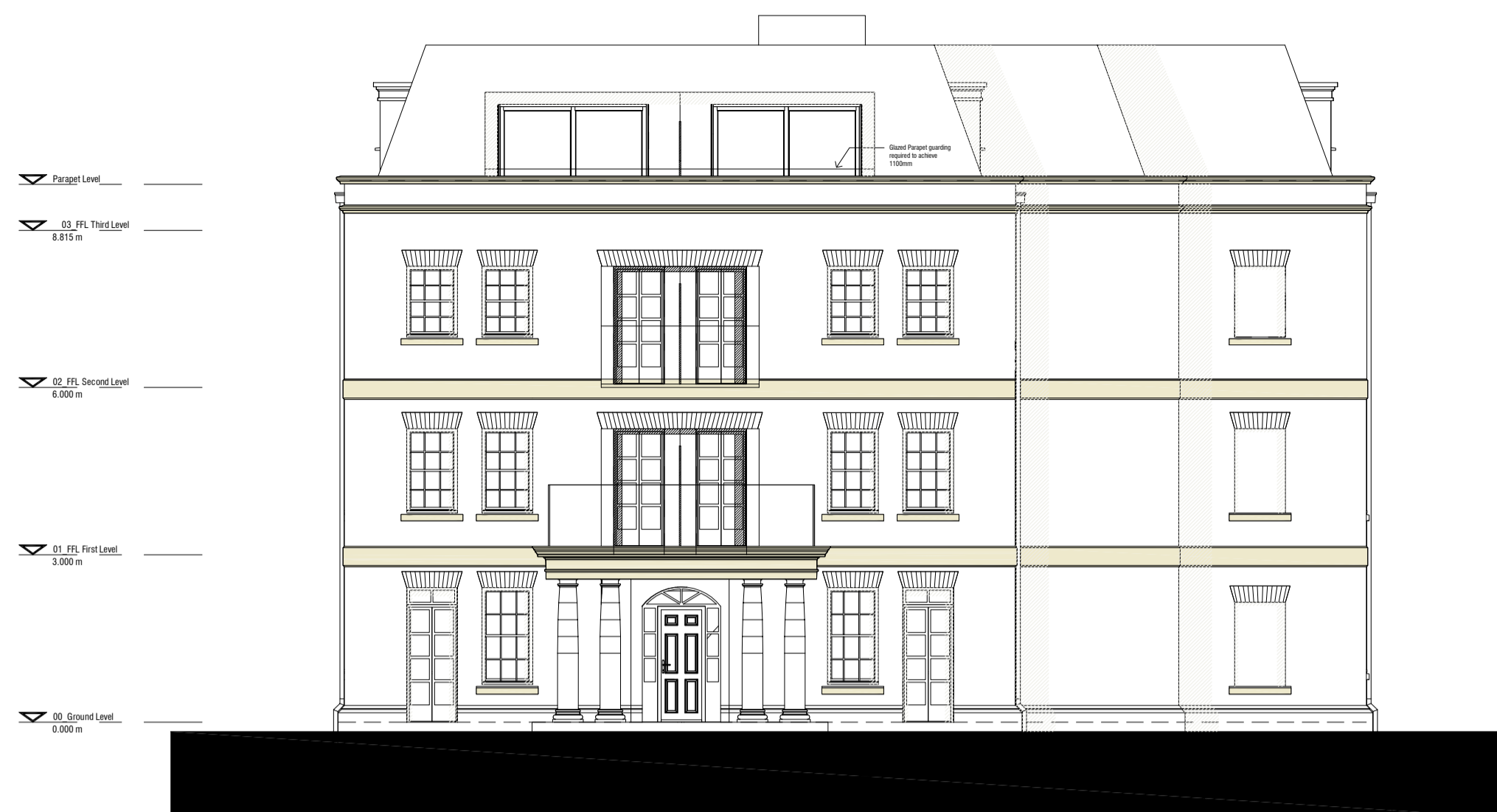
Front Elevation (AA) 1.100 @ A1