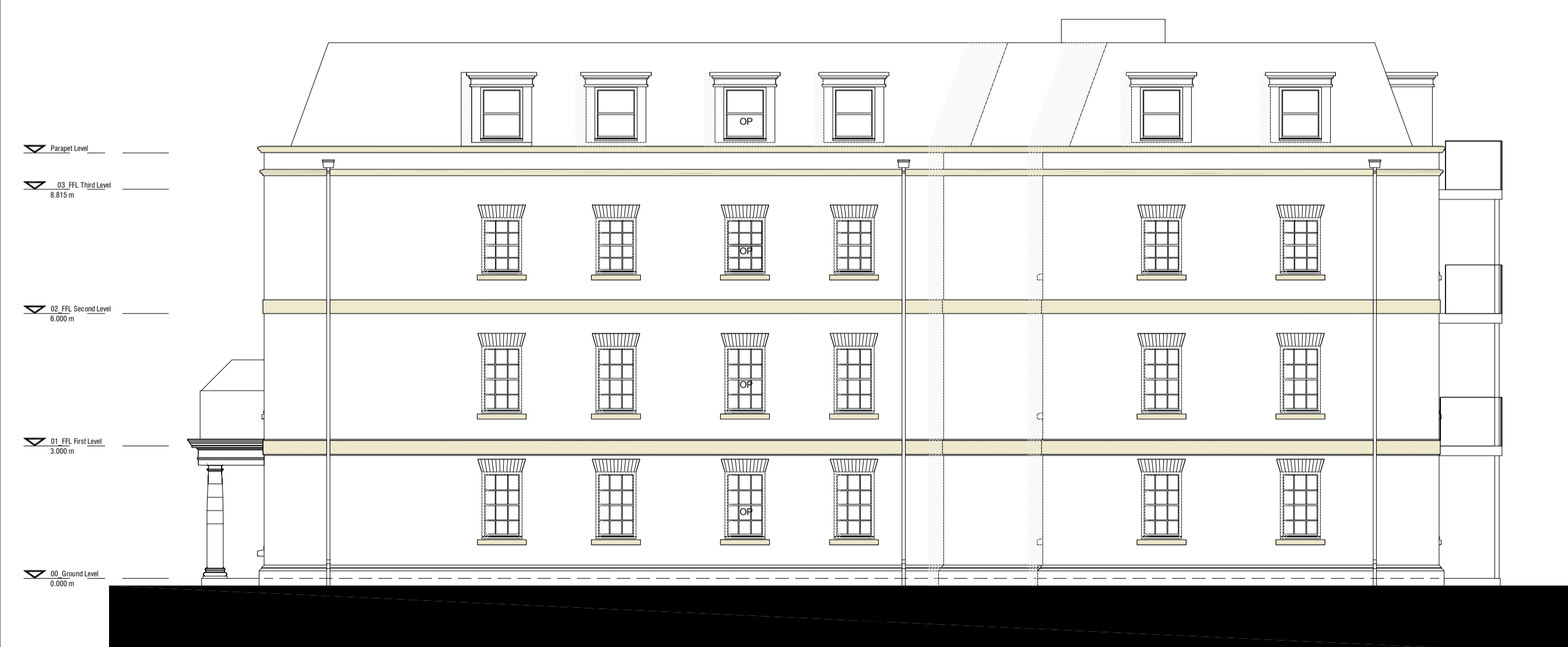
Side Flank Elevation (DD) 1.100 @ A1