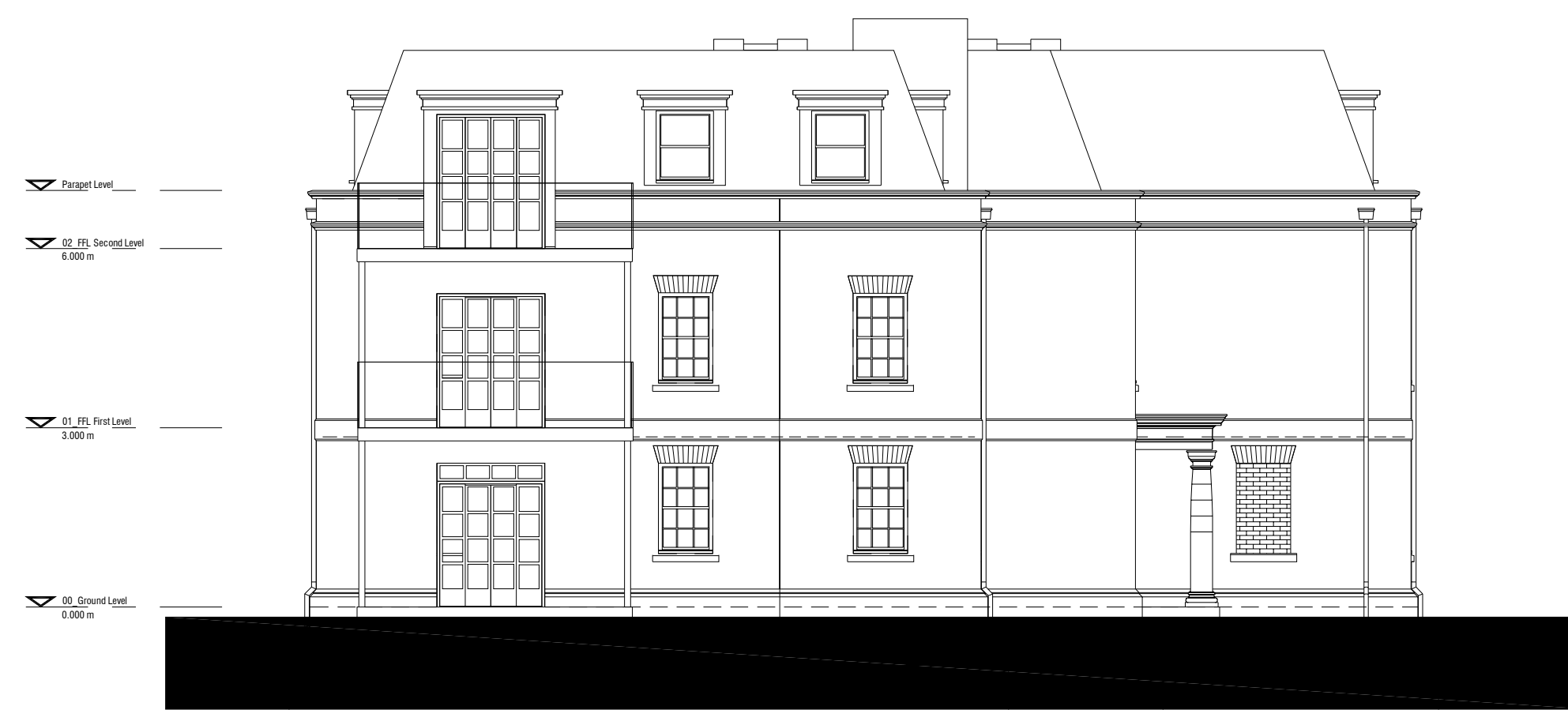
Rear Elevation (BB) 1.100 @ A1