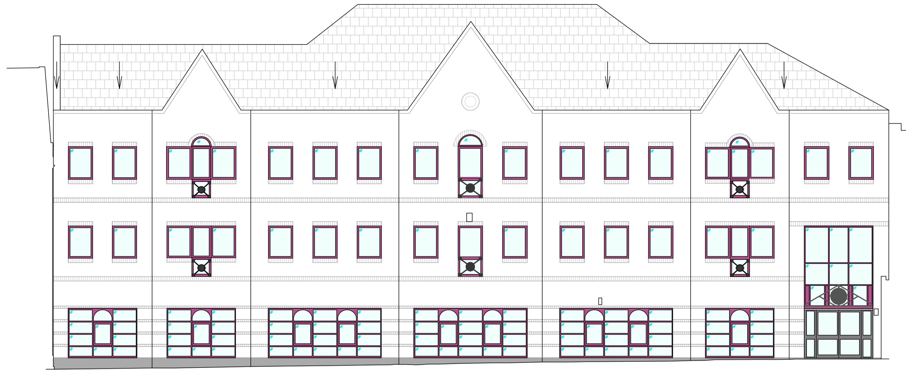
EXISTING FRONT ELEVATION A SCALE - 1:100

0m 1m 2m 3m 4m 5m 6m 7m 8m 9m 10m 11m 12m 13m 14m 15m