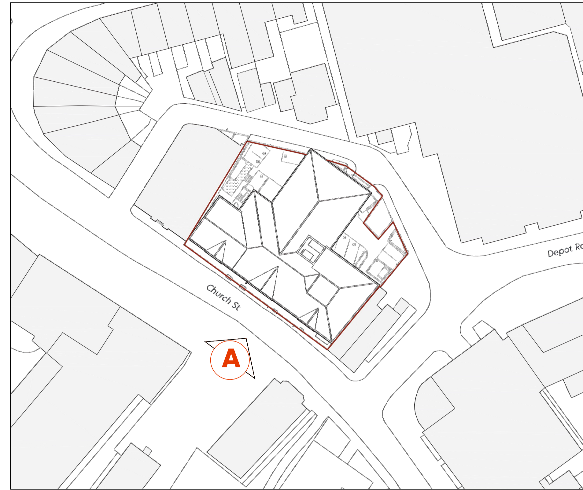
LOCATION PLAN - 1:500

0m 1m 2m 3m 4m 5m 6m 7m 8m 9m 10m 11m 12m 13m 14m 15m