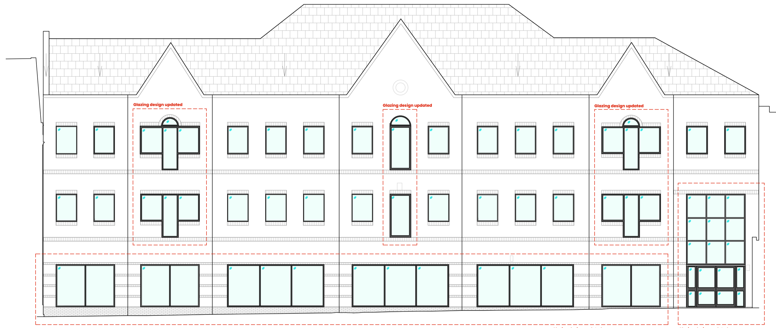
PROPOSED FRONT ELEVATION A SCALE - 1:100

0m 1m 2m 3m 4m 5m 6m 7m 8m 9m 10m 11m 12m 13m 14m 15m