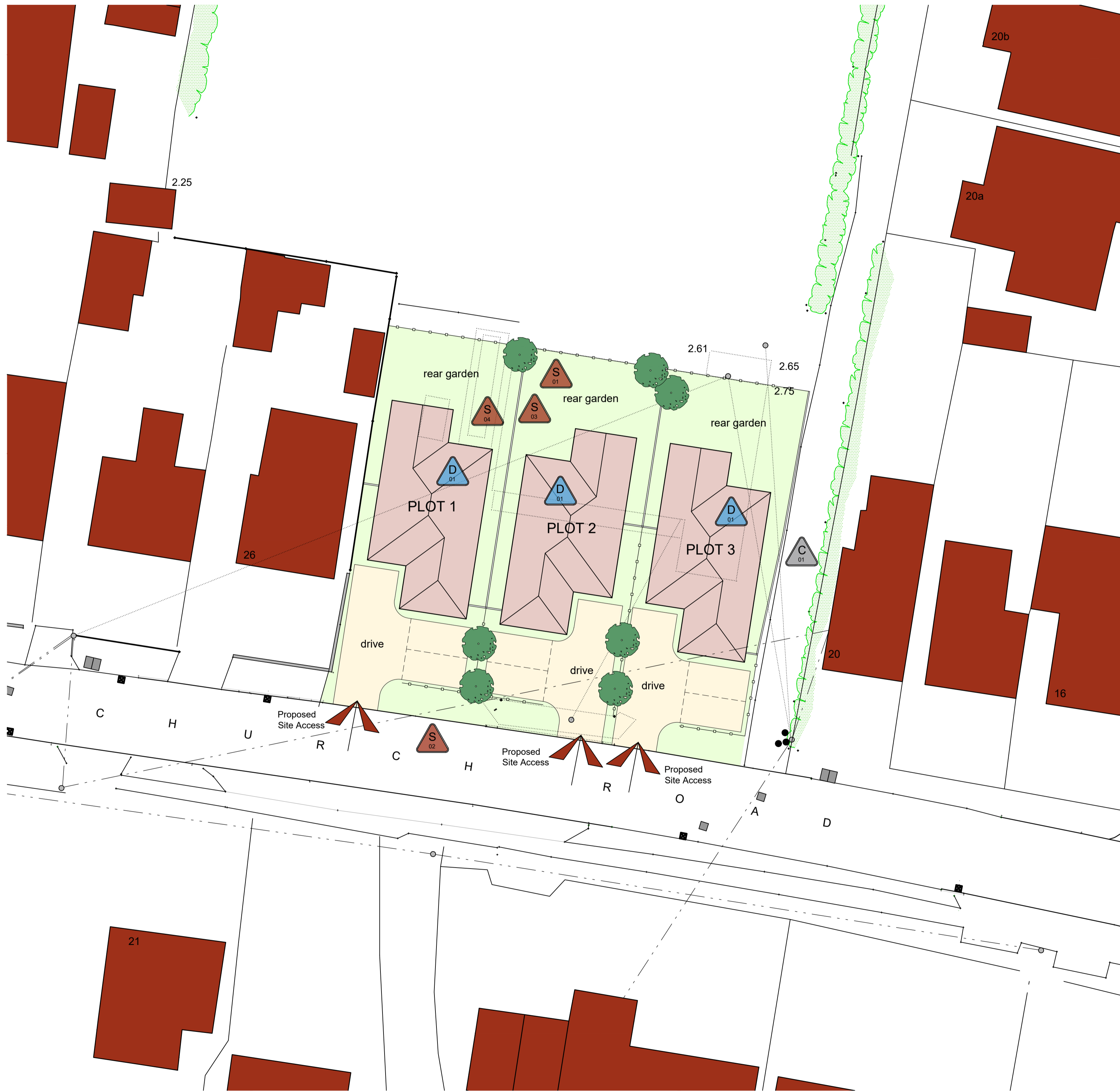
Site Plan Scale: 1:200 metres