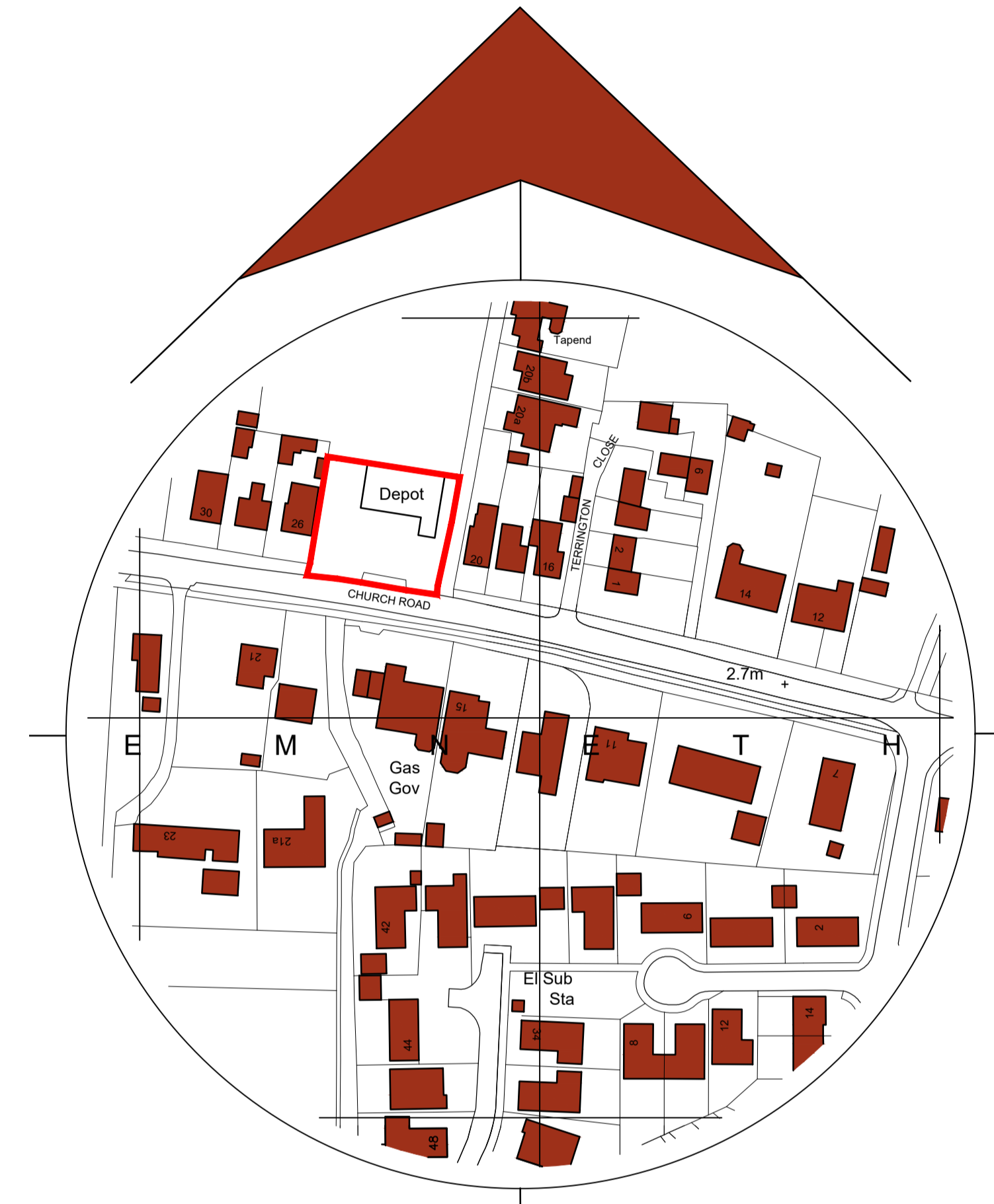
Location Plan Scale: 1:1250 metres