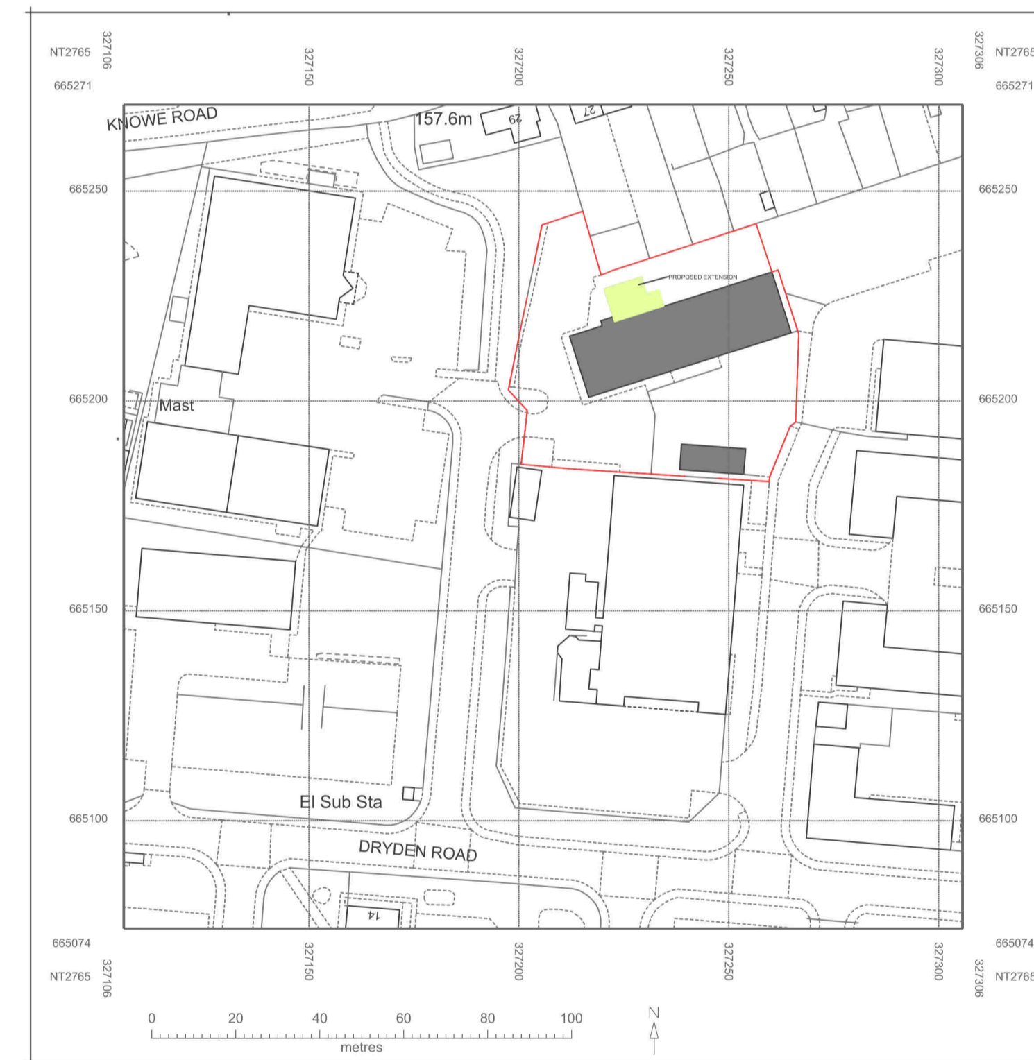
PROPOSED LOCATION PLAN